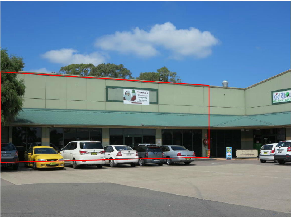
FRONT OF THE SITE