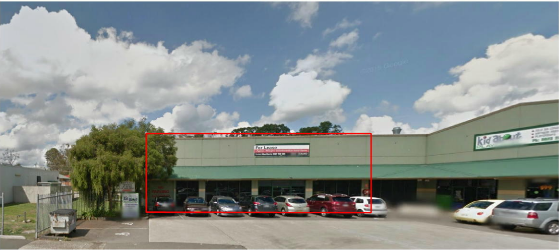
FRONT OF THE SITE