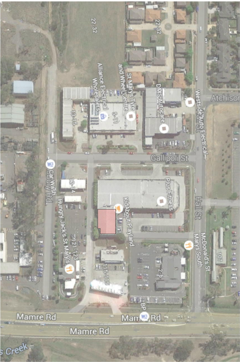
SATELLITE VIEW OF THE SITE