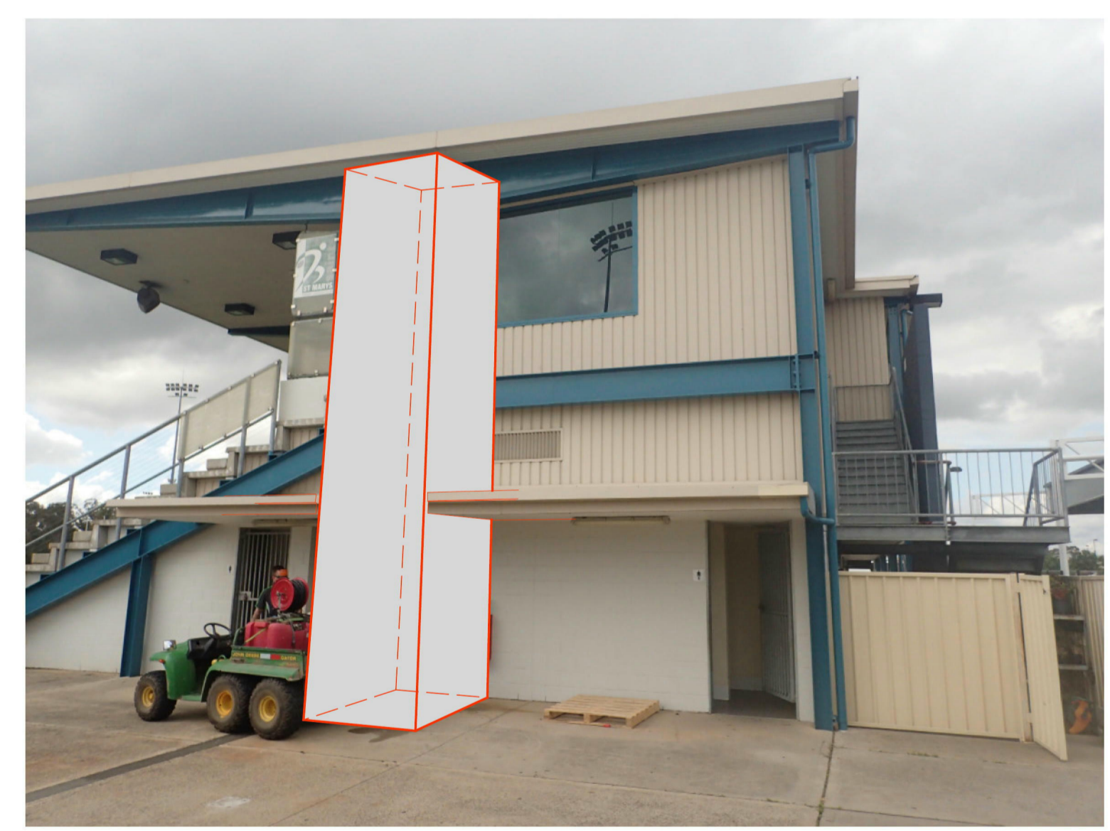
INDICATIVE VIEW N.T.S.