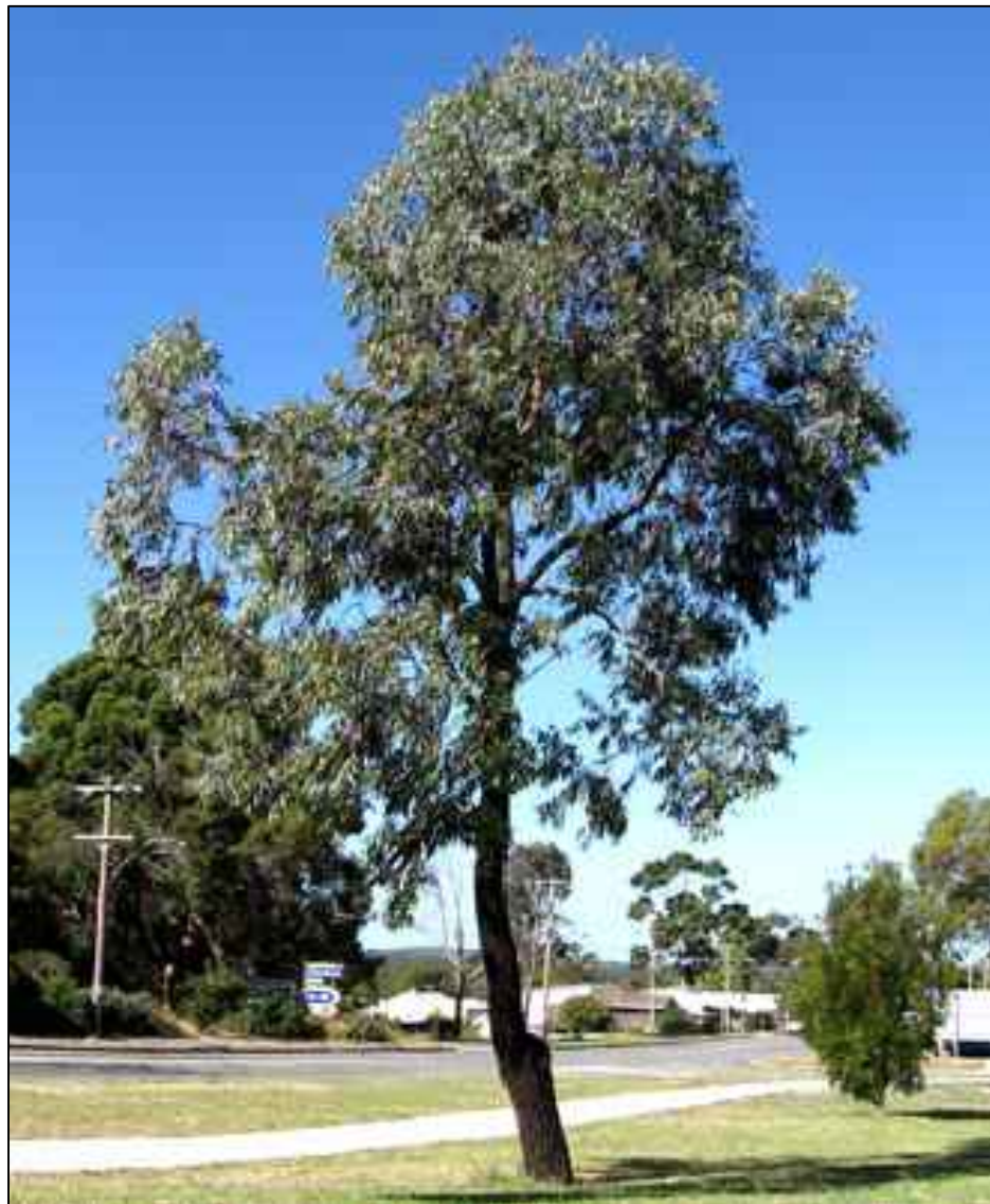
Eucalyptus sideroxylon 'Rosea'