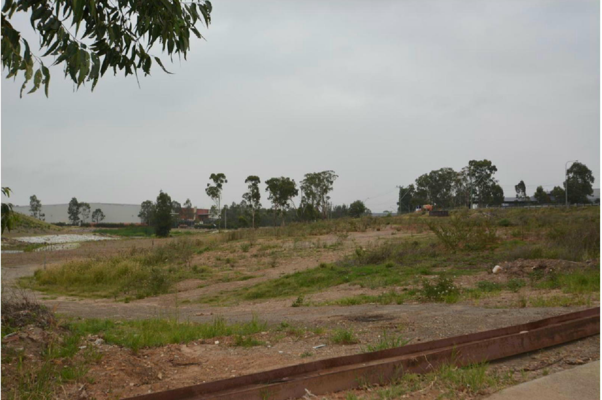
View of the site from Lenore Drive