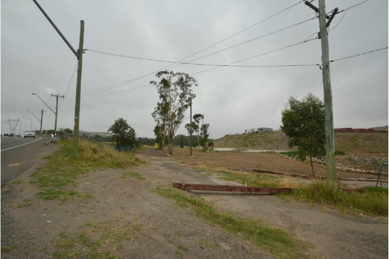
View of site looking north from Erskine Park Road