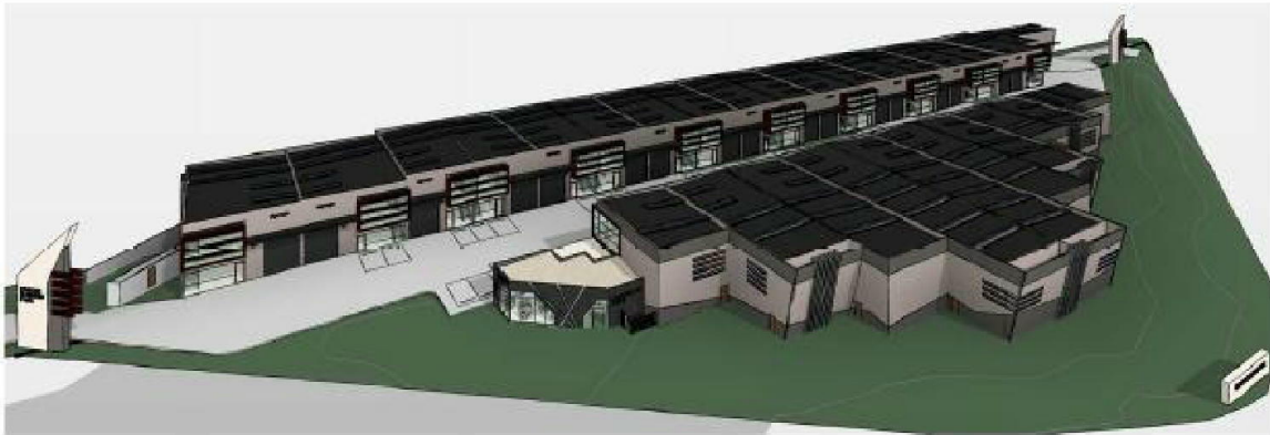
Images of the proposed development

The industrial units are designed to attract small business owners requiring affordable space within a well serviced industrial locality. Such small units are designed to complement the larger warehouse style industrial complexes within the catchment and better address vehicle access considerations.