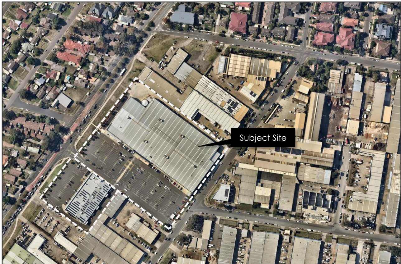
Figure 2 Site Context (29 October 2019)

The site is located within a Business Development Zone (B5) which is subject to the Penrith City Development Control Plan.