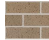
AUSTRAL BRICKS Whitsunday, Brampton Off White Mortar, Iron joint