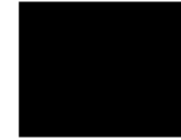
WINDOWS Bradnams, Custom Black Matt