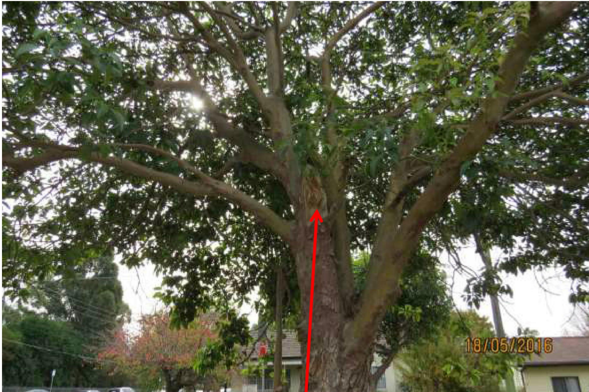
Photo 12 Tree 17 has a had a recent branch failure/tear out