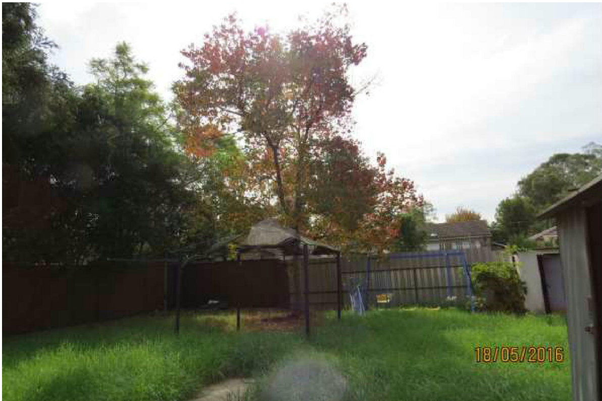
Photo 9 Tree 10