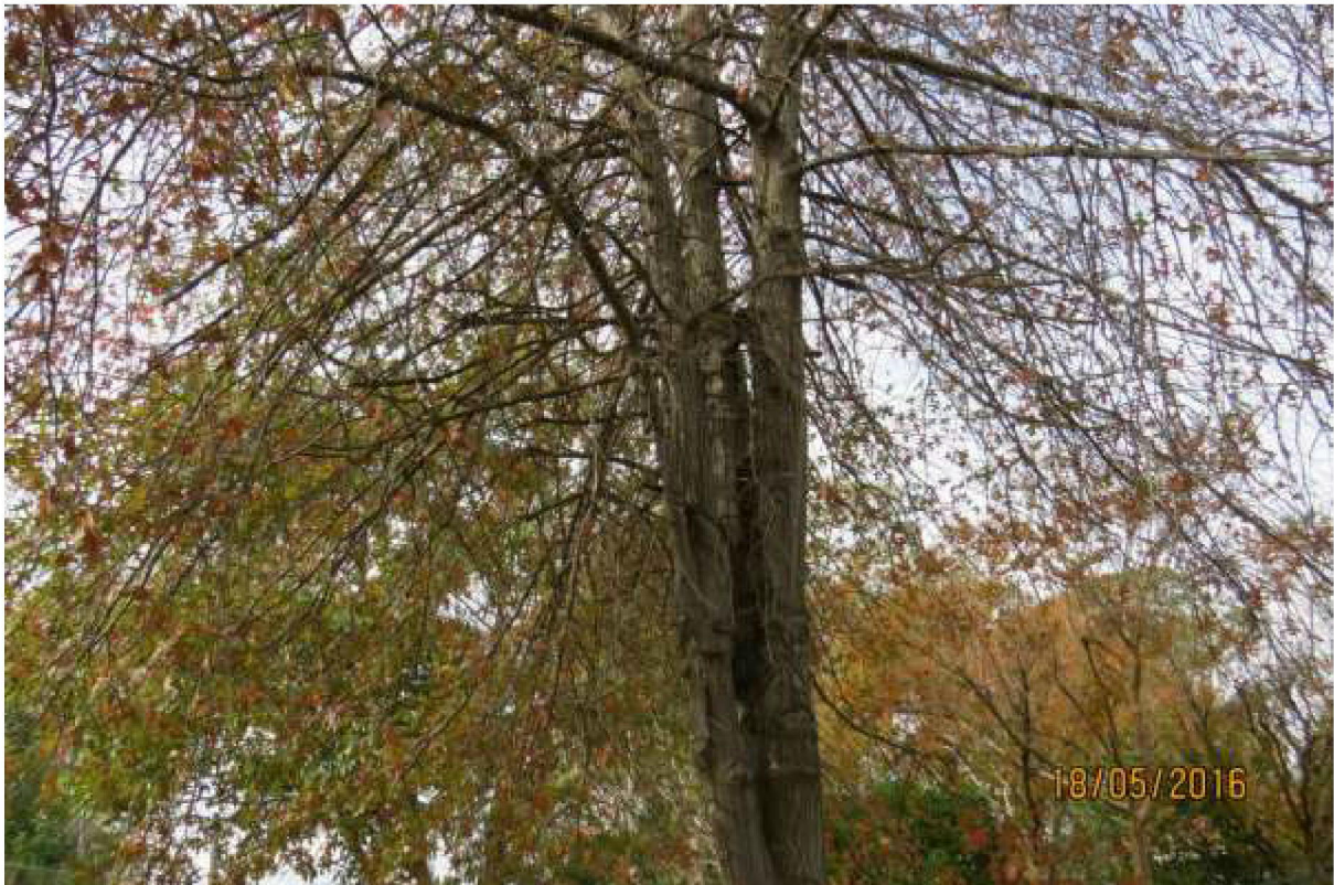
Photo 11 Tree 12 has a union of two trunks growing together