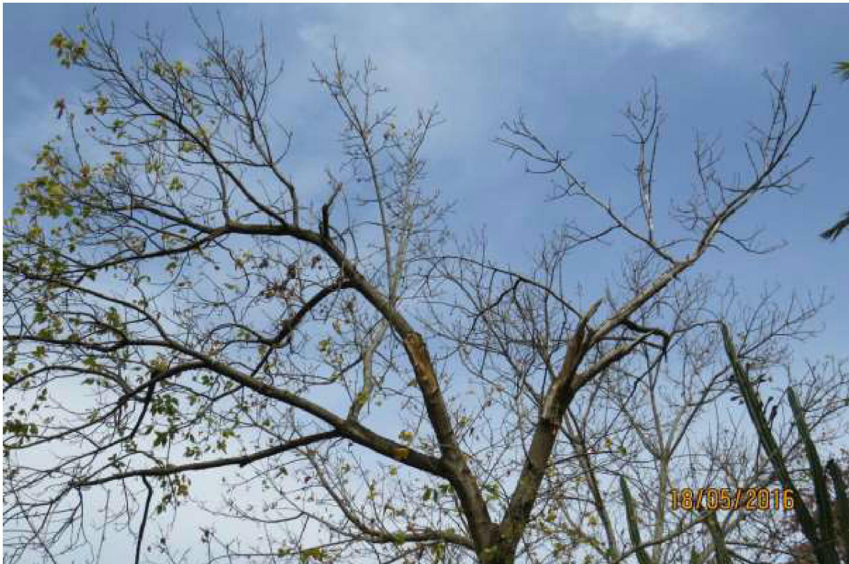
Photo 15 Tree 19 top is dead and has had some branches fail