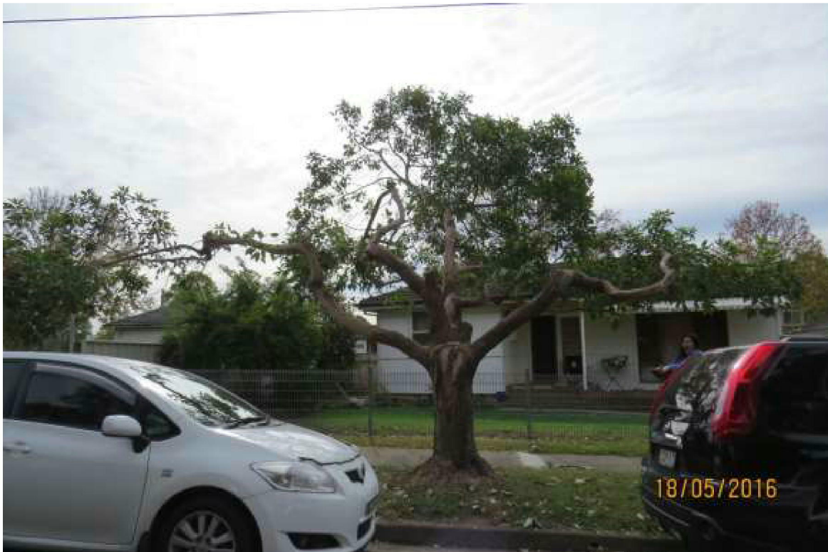
Photo 1 Tree 1