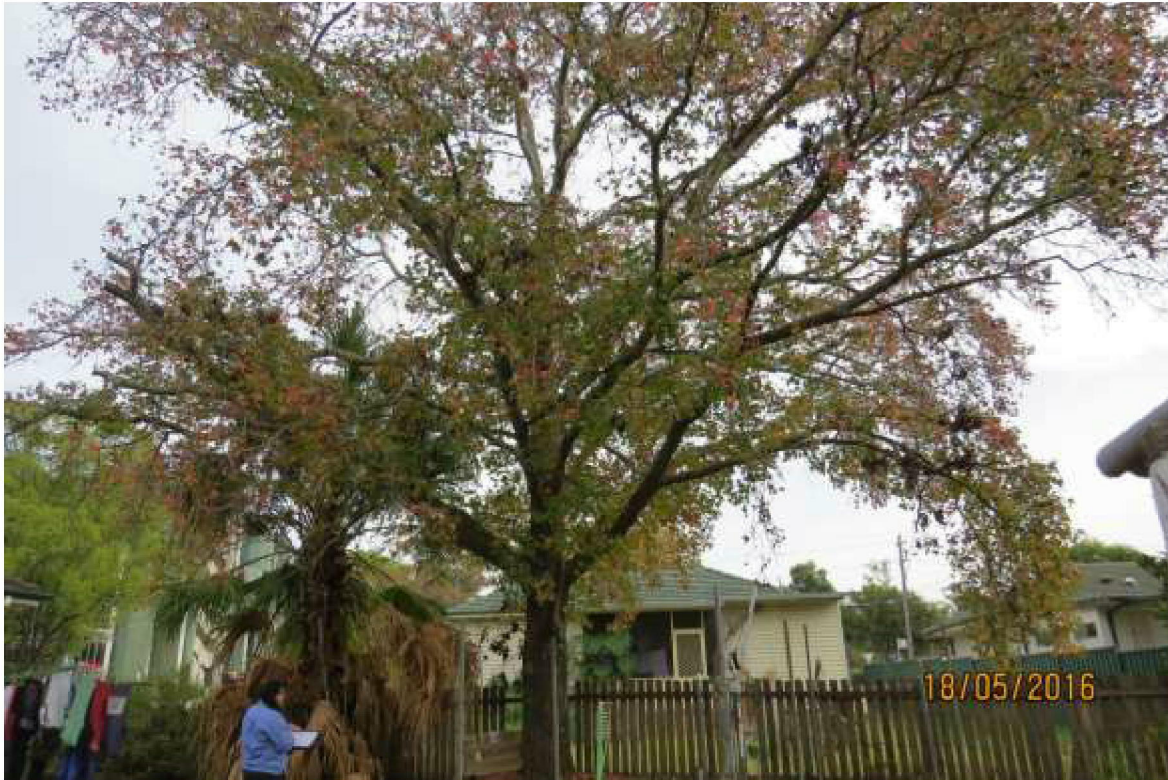
Photo 2 Tree 2