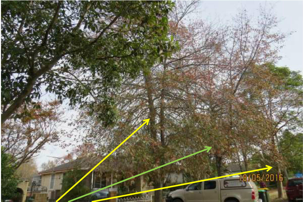
Photo 10 Trees 12, 13 and 14