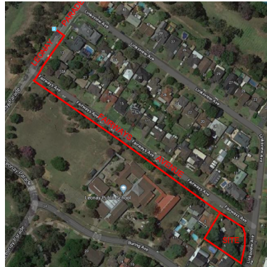
Route from site to the bus stop on Leonay Parade