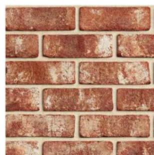
05 external garage walls & subfloor recycled brick