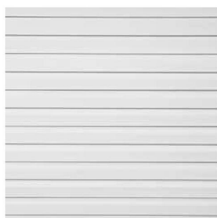
02 weatherboard cladding antique white paint finish