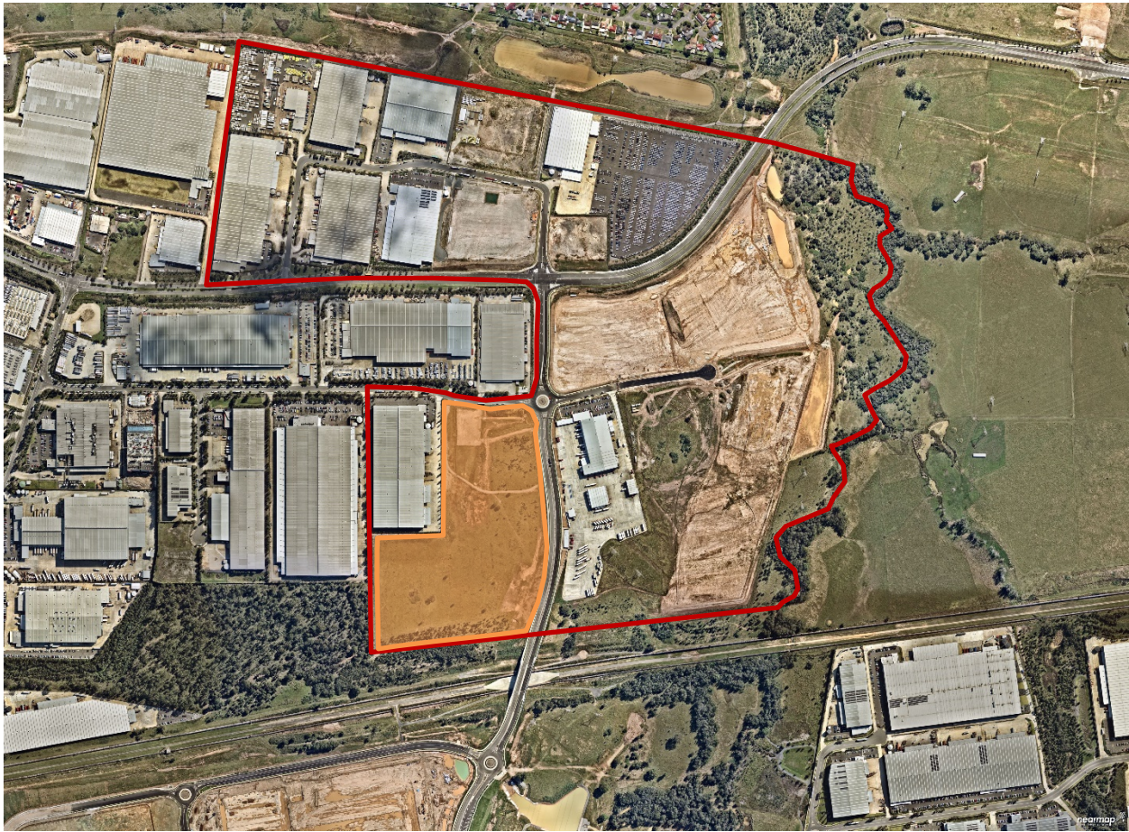
Figure 1.1: The Fitzpatrick Industrial Estate

employment generating activities whilst providing strong links with the major transportation infrastructure to facilitate the movement of goods regionally, nationally and internationally.