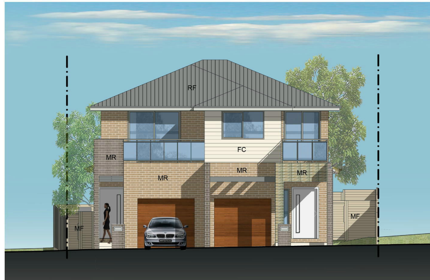
O'CONNELL LANE VIEW

NOTE: THIS COLOR SCHEDULE IS FOR ILLUSTRATIVE PURPOSES ONLY. DO NOT STAMP OR INCLUDE IN DA CONDITIONS.