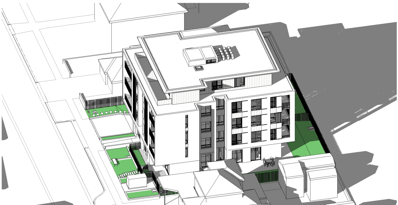
EAST VIEW - 2.30PM JUN 22