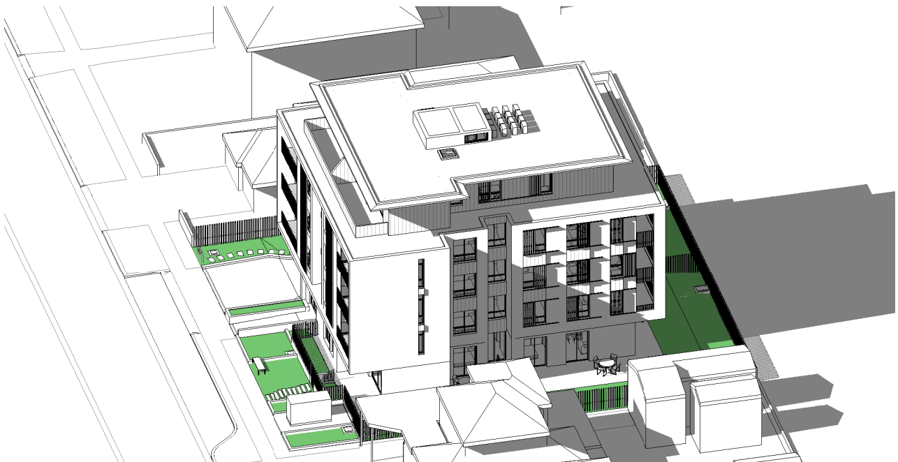
EAST VIEW - 12.30PM JUN 22