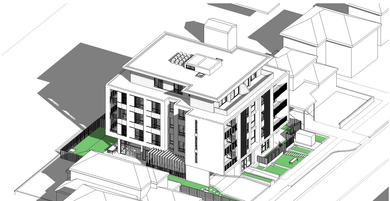
WEST VIEW - 10.30AM JUN 22