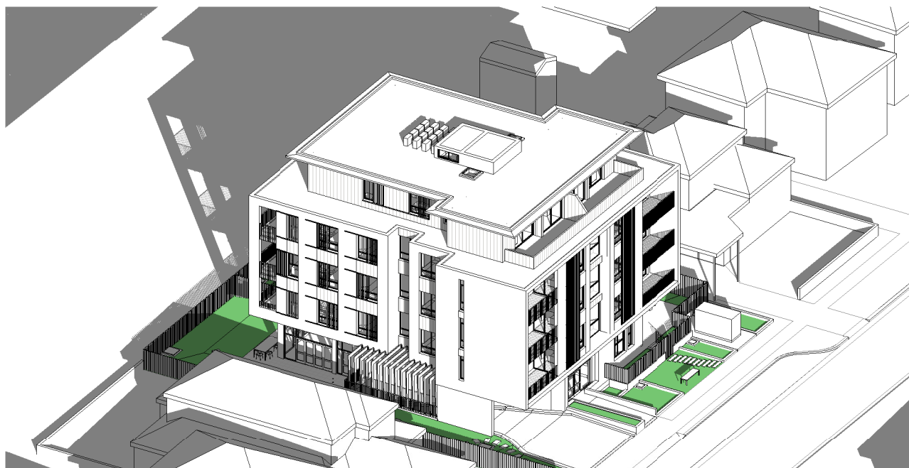
WEST VIEW - 9AM JUN 22