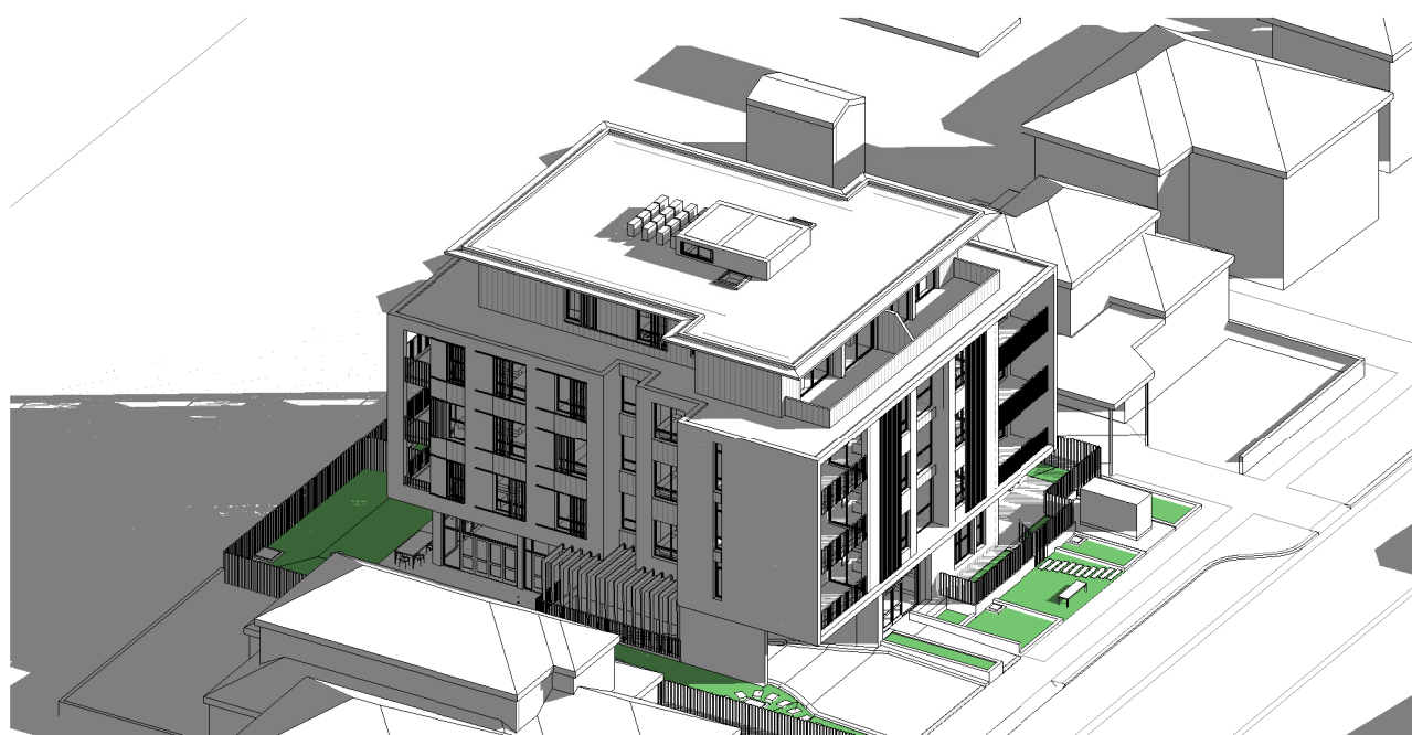
WEST VIEW - 2.30PM JUN 22