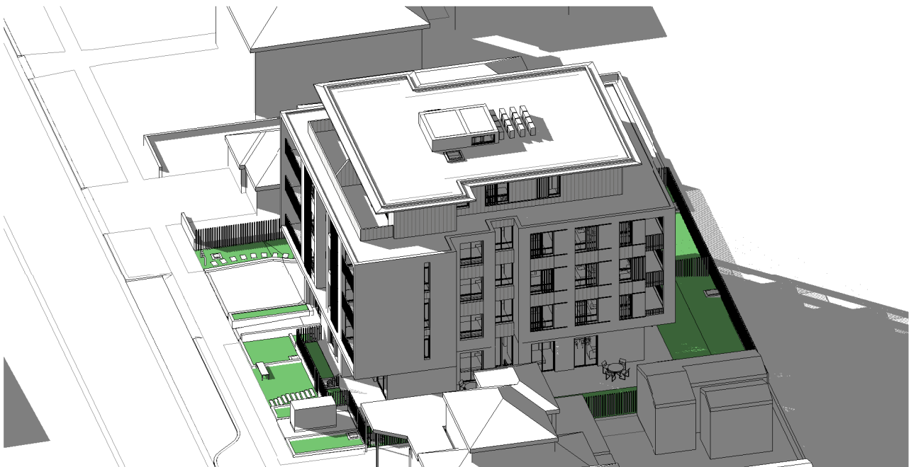
EAST VIEW - 9.30AM JUN