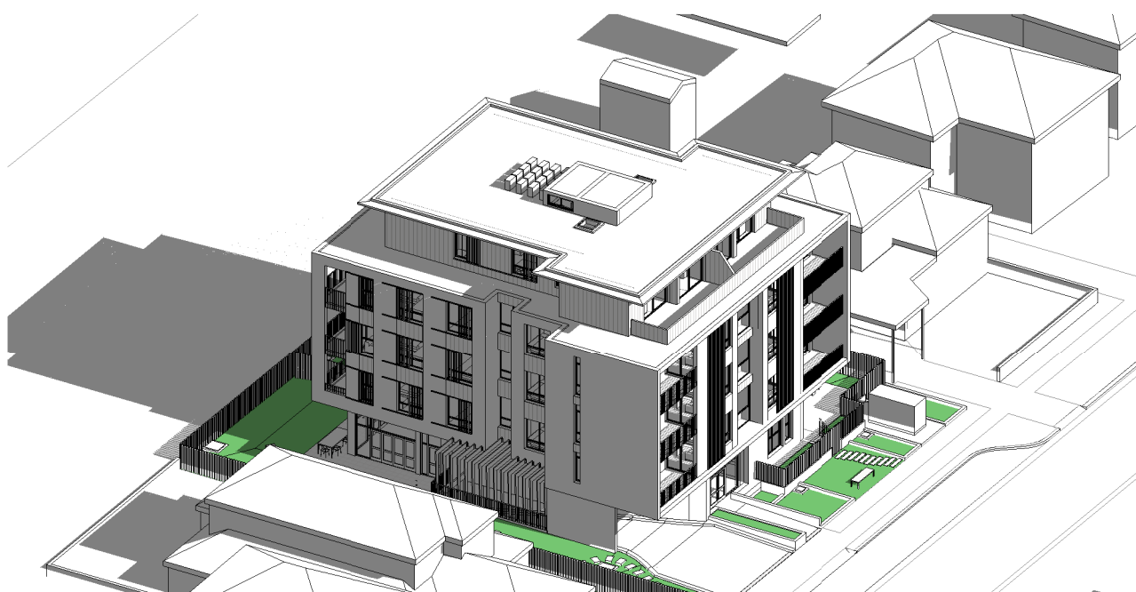
WEST VIEW - 12.30PM JUN 22