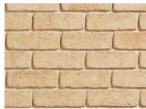
PGH BRICKS "VAN GOGH"