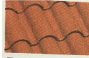
TERRACOTTA ROOF TILES "TRANS ROJA"