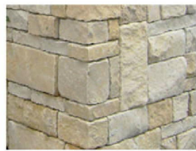
CINAJUS TUSCAN LIMESTONE