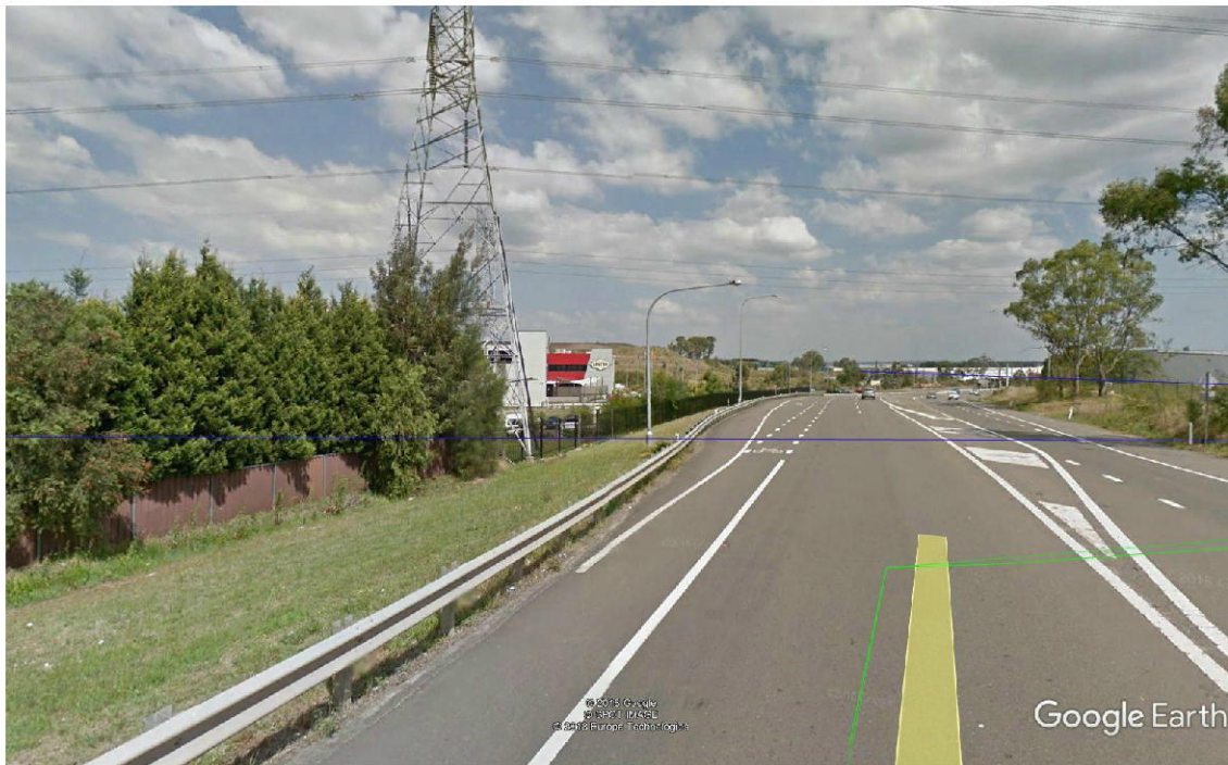
View of the site from the closest residential property to the north

The subject site at its closest point is approximately 246m away from the closest residential properties to the north. As evident from the image below the proposed development will not be visible or noticeable from the residential properties given the distance separating the site, the change in topography and the low scale nature of the proposed development.