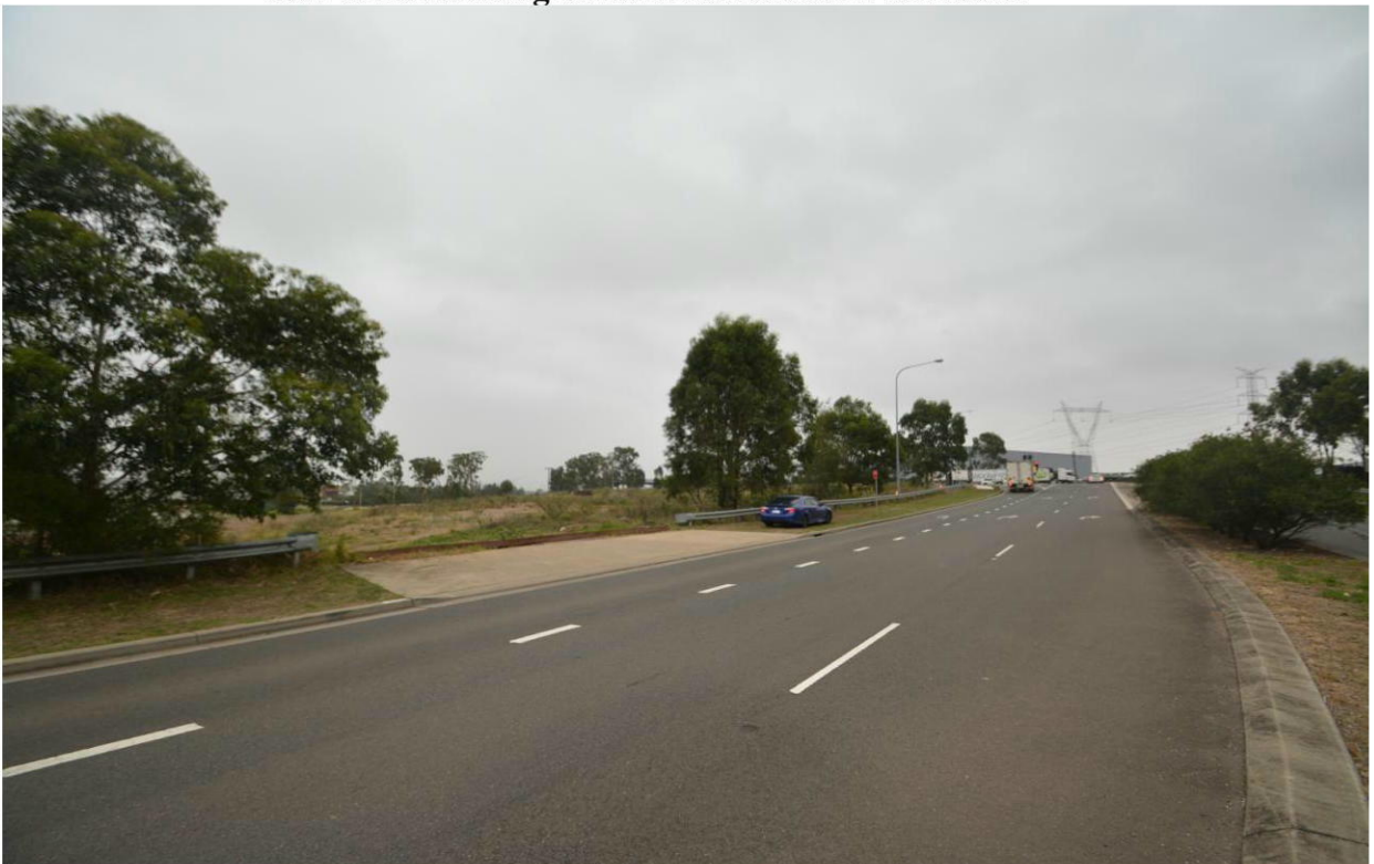
View of the site from Lenore Drive