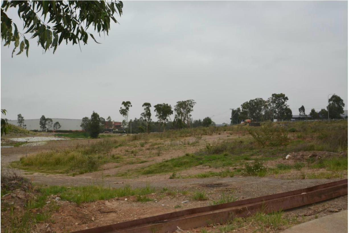
View of the site from Lenore Drive