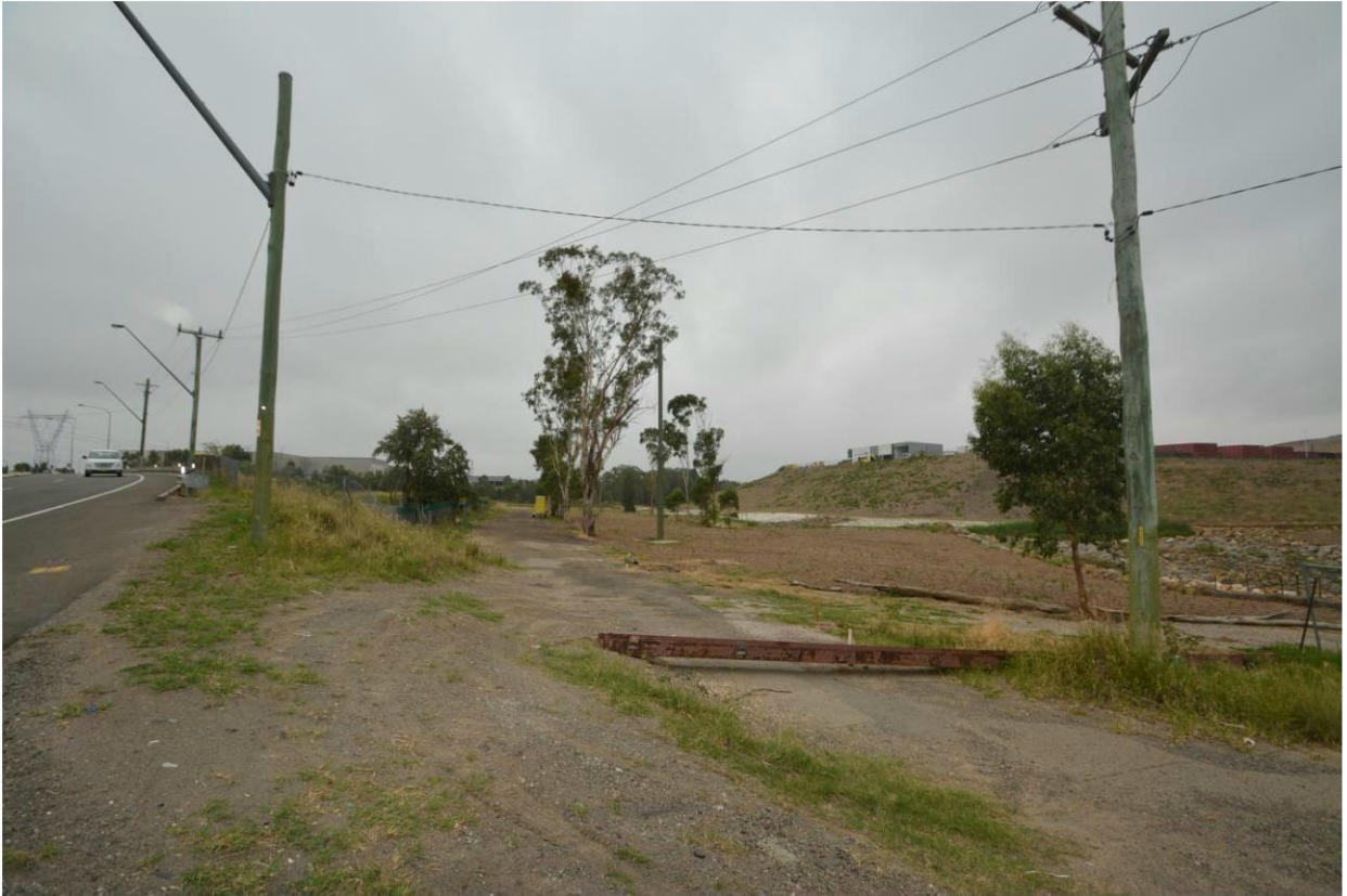
View of site looking north from Erskine Park Road