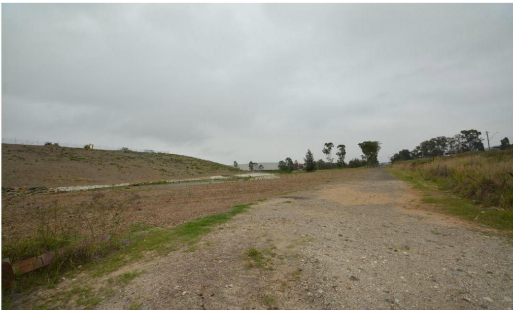
View of southern boundary and adjoining creek and rehabilitated green corridor

On averaging, the proposed setbacks are appropriate given the low scale nature of the development. With regards to the rear setback to the creek and vast surrounds, 2m is proposed allowing for an emergency access route on-site and simple built form facing the creek environs with pockets of landscaping. Council has ensured with the development of the creek and surrounds that substantial green space is proposed to protect the creek and assist with its landscape generation. No further setback on the subject site is considered necessary given the expanse of land to the south.