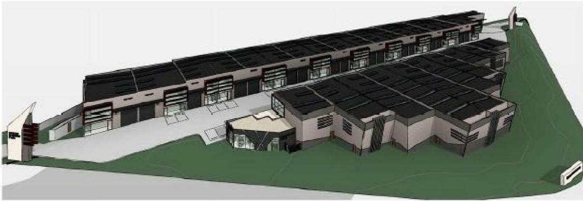
Images of the proposed development

The industrial units are designed to attract small business owners requiring affordable space within a well serviced industrial locality. Such small units are designed to complement the larger warehouse style industrial complexes within the catchment and better address vehicle access considerations.