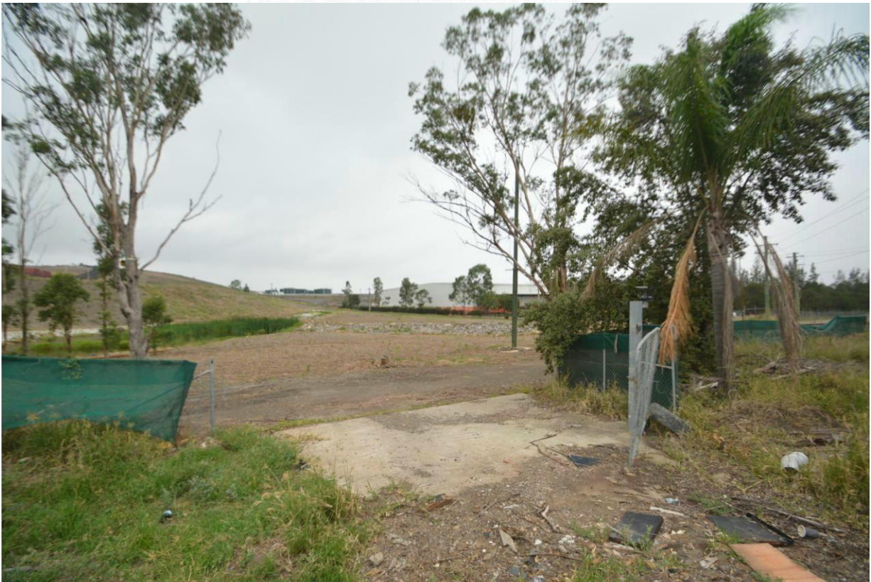
View of site from Erskine Park Road