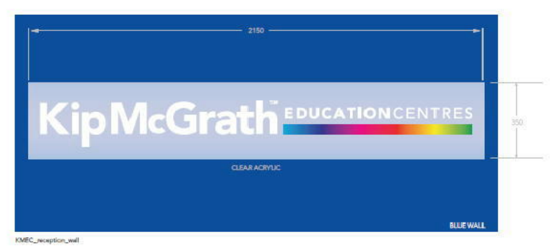
Reception area sign.

The above sign will be placed on the wall in the reception area. The sign consists of vinyl lettering and a spectrum attached to clear acrylic. The acrylic panel should be pin fixed out from the reception wall. The colours of the lettering and the wall will be reversed (i.e. blue lettering and white wall) as the area is to be painted white.