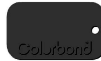
4. Powder coated Aluminium Window and Door Frames, Louvers & Ballustrade Colorbond Monument colour (or equivalent)