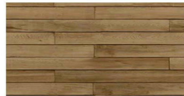
2. Cladding Timber Look- INNOWOOD External Cladding Tasmania Oak colour (or equivalent)