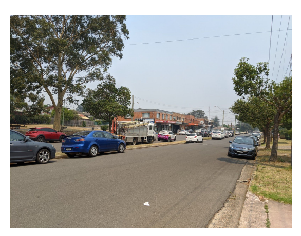
BELOW Stafford Street Proper Approaching Shops from East (Old Northern Rd)

Two Way Service Road with parking both sides approaching the Stafford Street Shops (Pauline Fields park to the left)