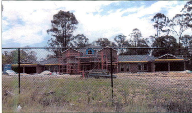
Figure 3 – Photographs of Other Developments