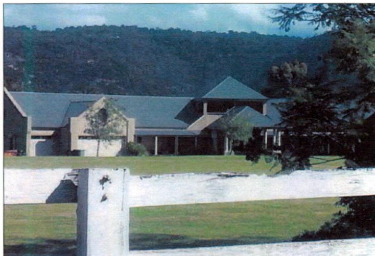
Figure 3 – Photographs of Other Developments