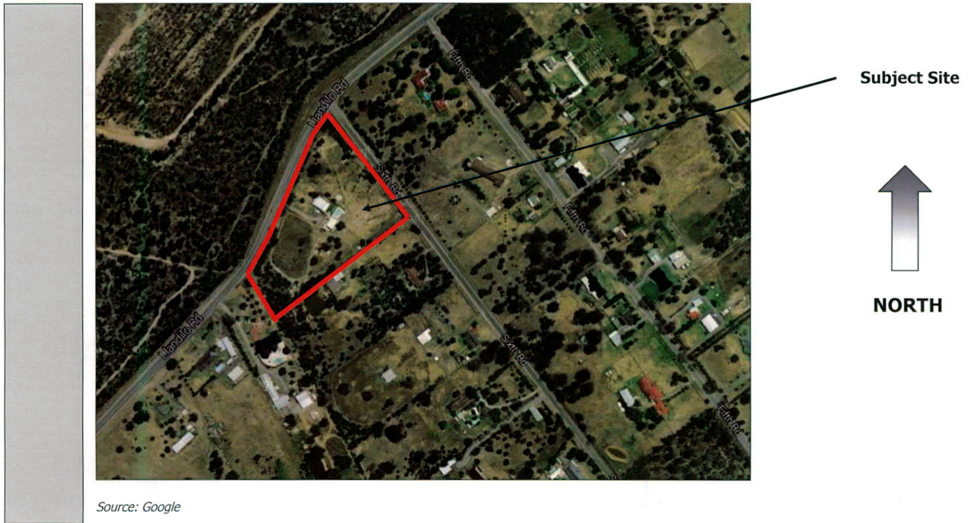
FIGURE 1 – SITE LOCATION MAP