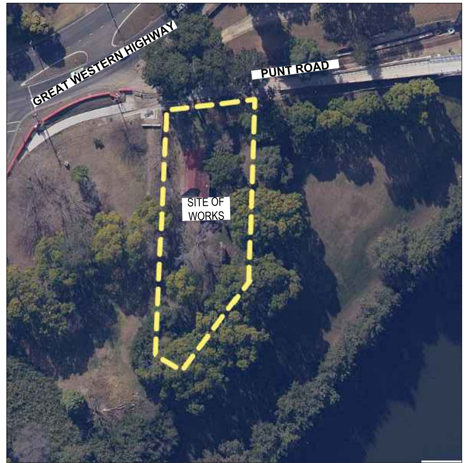
IMAGE CAPTURED FROM NSW PLANNING PORTAL DATE 19.12.2020