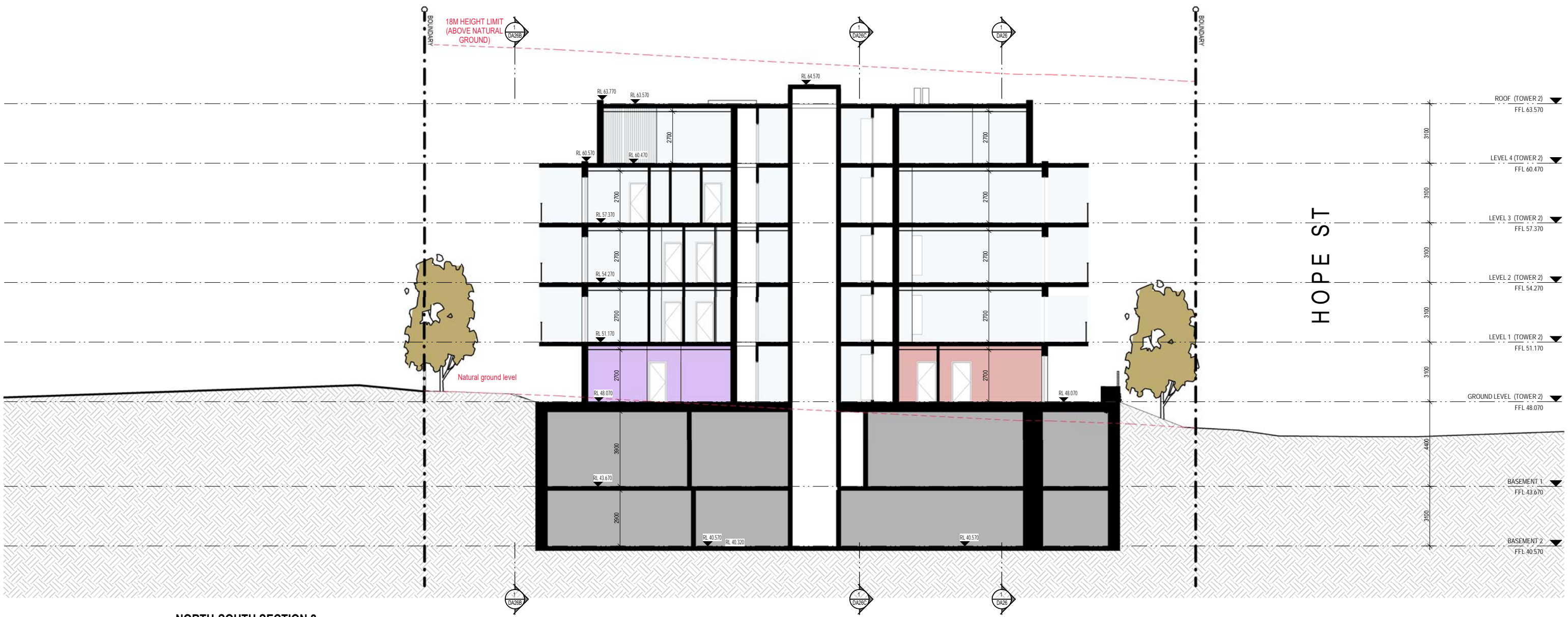
NORTH-SOUTH SECTION 2 1 : 100