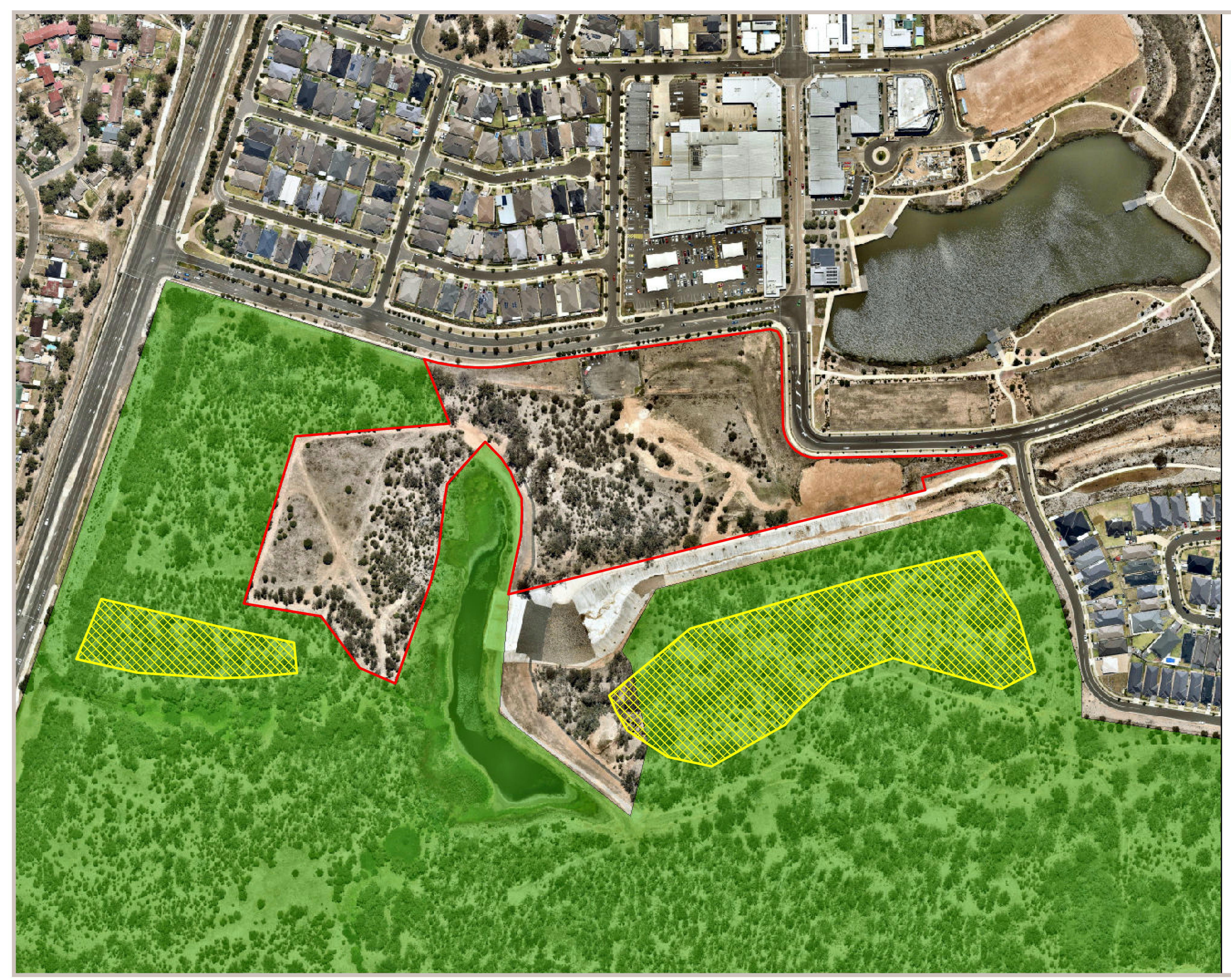
Figure 3.1. Suitable release sites for the Cumberland Plain Land Snail