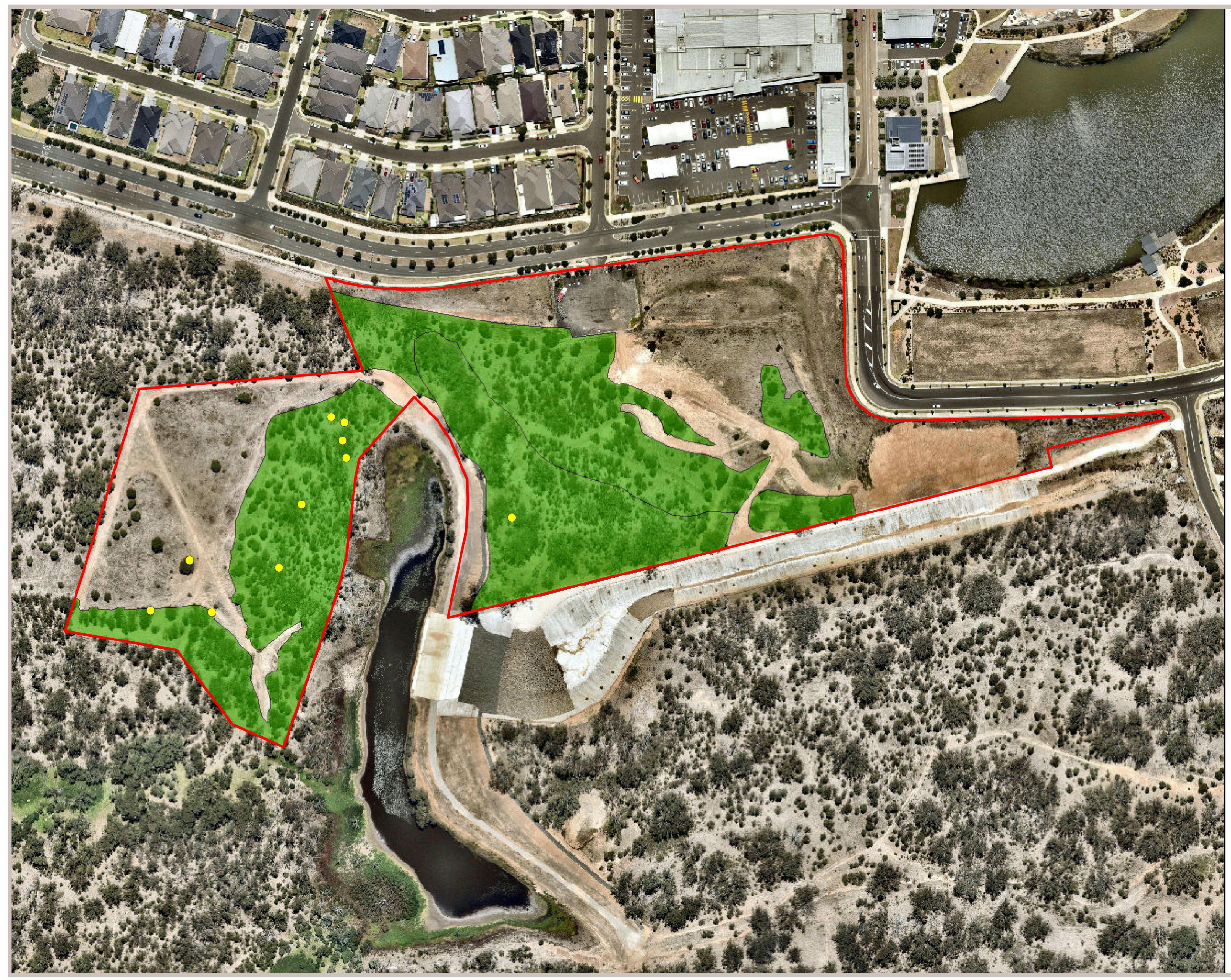
Figure 2.1. Potential habitat for the Cumberland Plain Land Snail in the subject site and locations of recorded shells