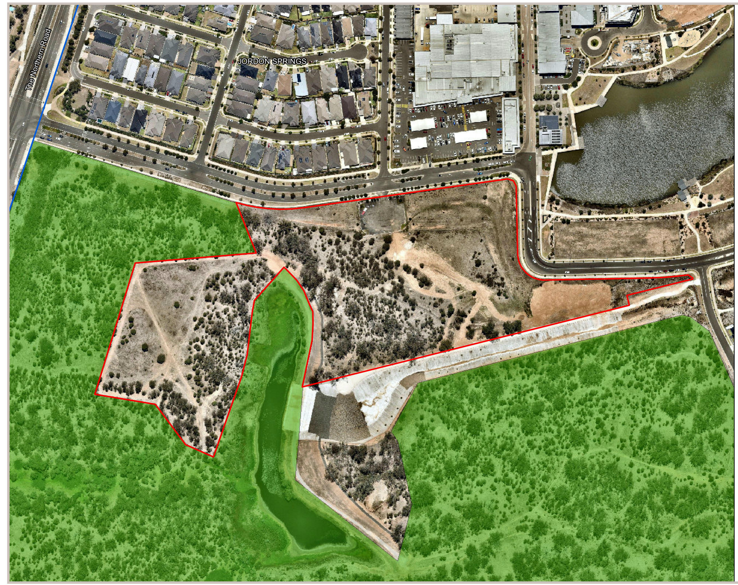
Figure 1.2. Location of the subject site