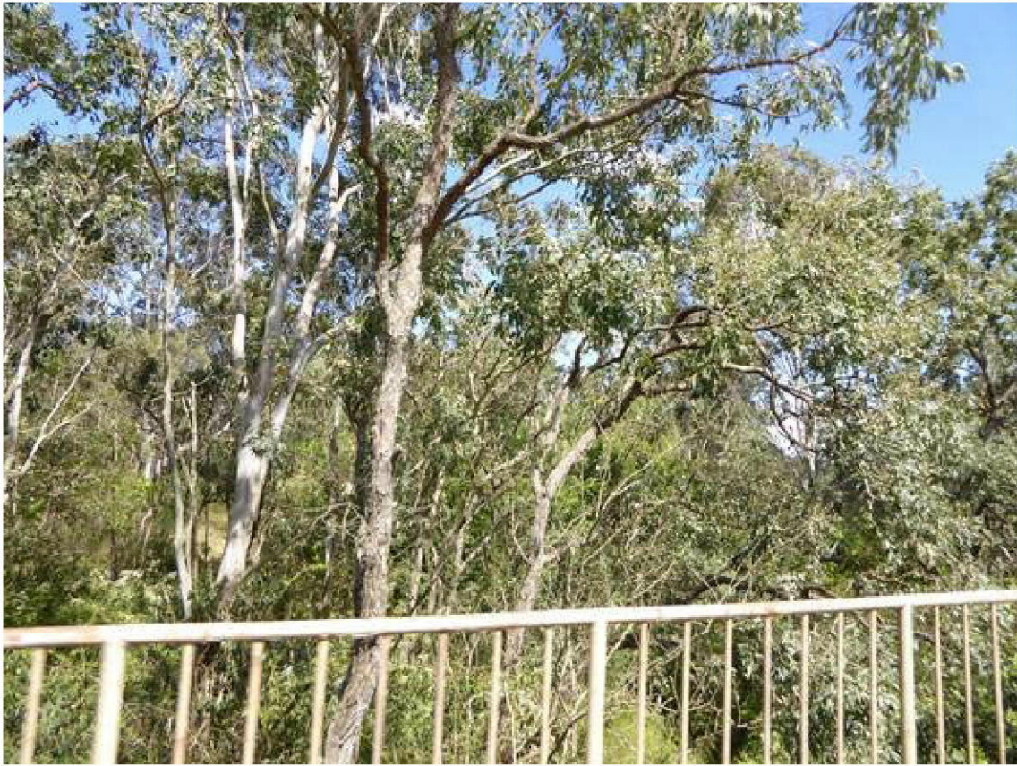
Photograph 3 River-flat Eucalypt Forest in South Creek riparian area

Low Diversity Derived Native Grassland and Exotic Pasture are present throughout much of the subject site, between patches of woodland and shrubland, and on the road verges, as shown in Photograph 4 .