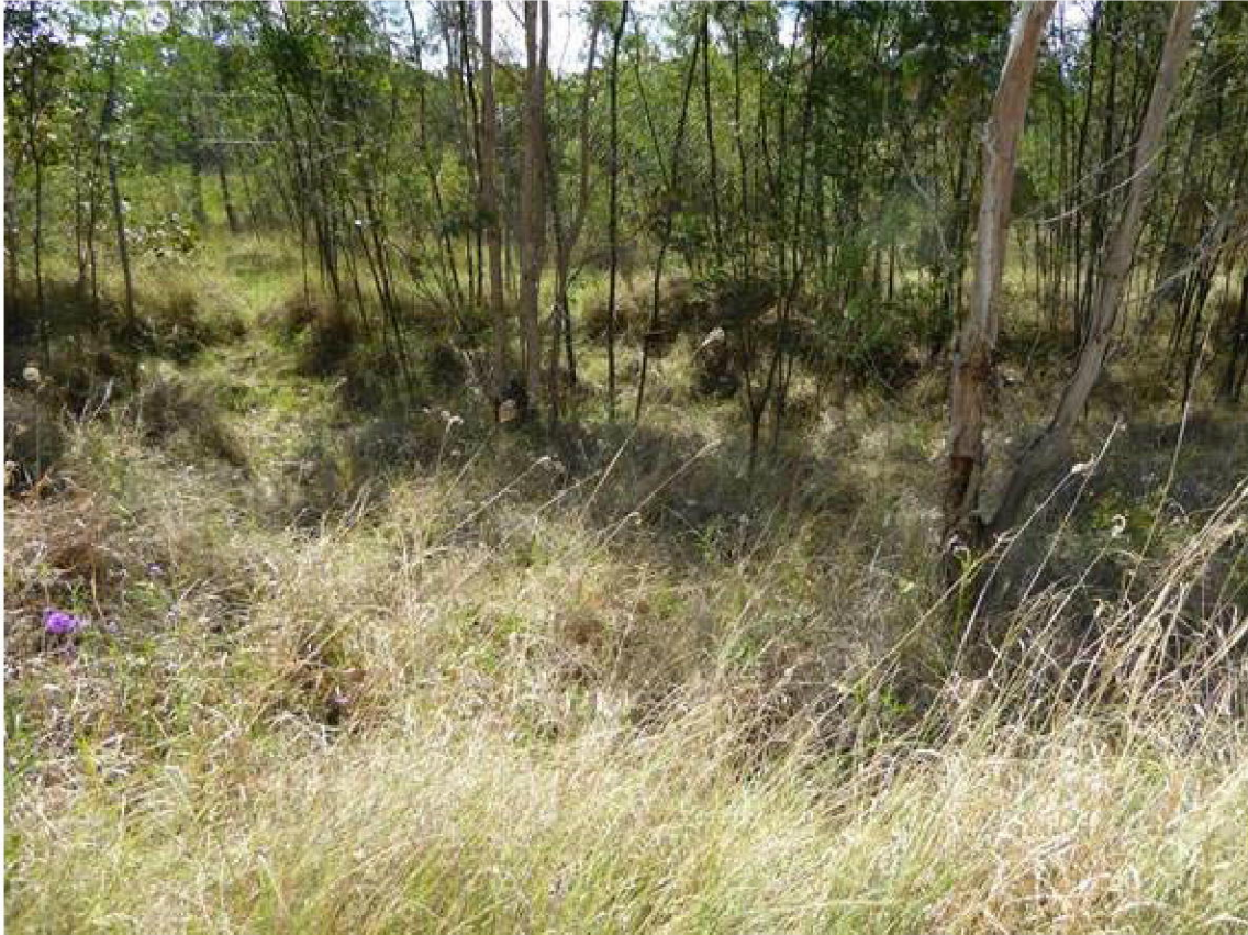
Photograph 4 Low Diversity Derived Native Grassland and Exotic Pasture in the road corridor