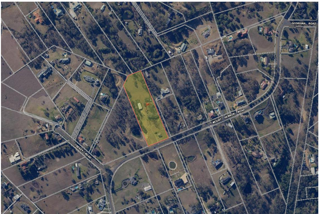
Figure 1 - Site Location

The property is approximately 262m long and 79m wide; the total site area is 1.98ha. A full copy of the site survey plan has been provided in Appendix A of this report.