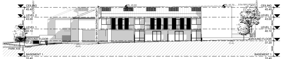
3 NP - EAST ELEVATION N.T.S