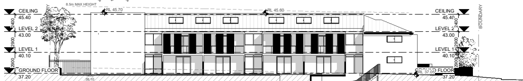
2 NP - WEST ELEVATION N.T.S