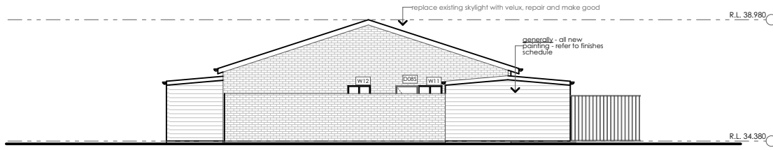
ELEVATION 02 / EAST 1:200