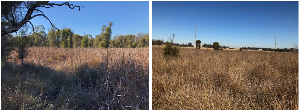
Plate 2: Freshwater Wetland