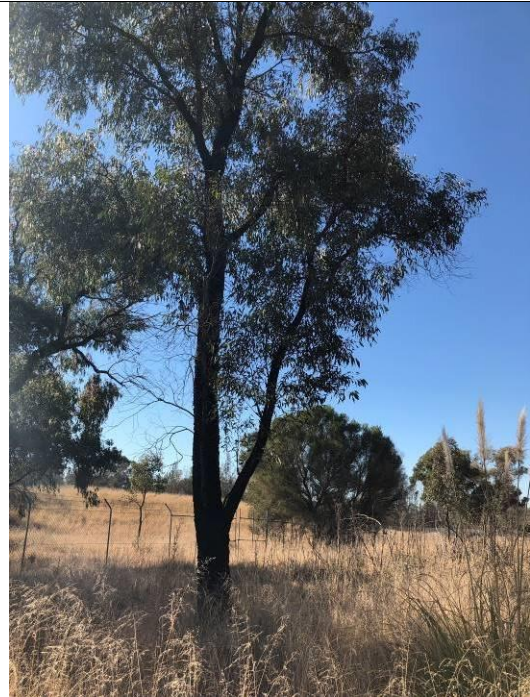
Plate 5: Cumberland Plain Woodland