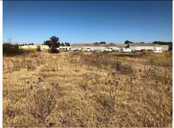
Plate 4: Exotic Grassland