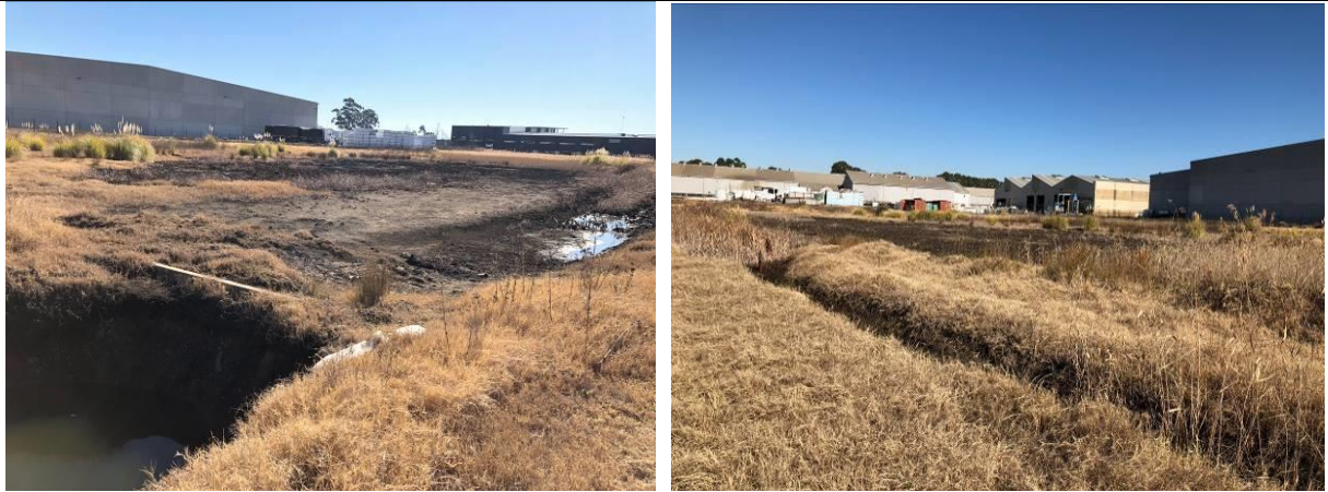
Plate 1: Disturbed Wetland