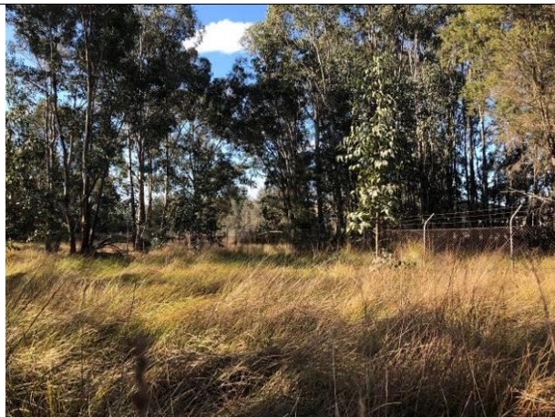
Plate 3: Native Grassland