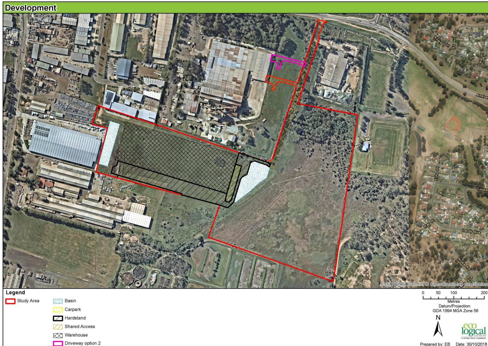
Figure 1: Study area and subject site