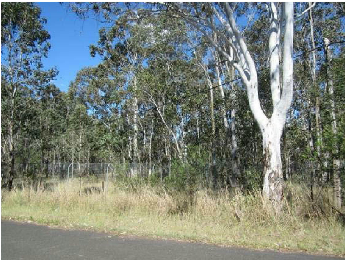
Photograph 1 Regenerating CPW on the subject site, adjoining the existing road

The CPW patches are generally open and regenerating, and interspersed with areas of low diversity derived native grassland and exotic grassland, as shown in Photograph 1 . Where present, the canopy is dominated by Eucalyptus tereticornis (Forest Red Gum) and E. moluccana (Grey Box) and a small tree layer of regenerating canopy species and Acacia parramattensis (Parramatta Wattle). A diverse shrub layer is present, dominated by native species; Daviesia ulicifolia , Grevillea juniperina ssp juniperina and Acacia parramattensis . The understorey is dominated by grasses, including the exotic species Eragrostis curvula and the natives Sporobolus crebra and Microlaena stipoides . The understorey includes a mix of native and exotic herbs, including natives; Eremophila debilis and Calotis lappulacea and exotics; Sida rhombifolia and Verbena bonariensis . Weed densities were generally low, although a small number of significant environmental weed species were recorded such as Ligustrum lucidum (Large-leaved Privet) and Olea europaea subsp. cuspidata (African Olive).