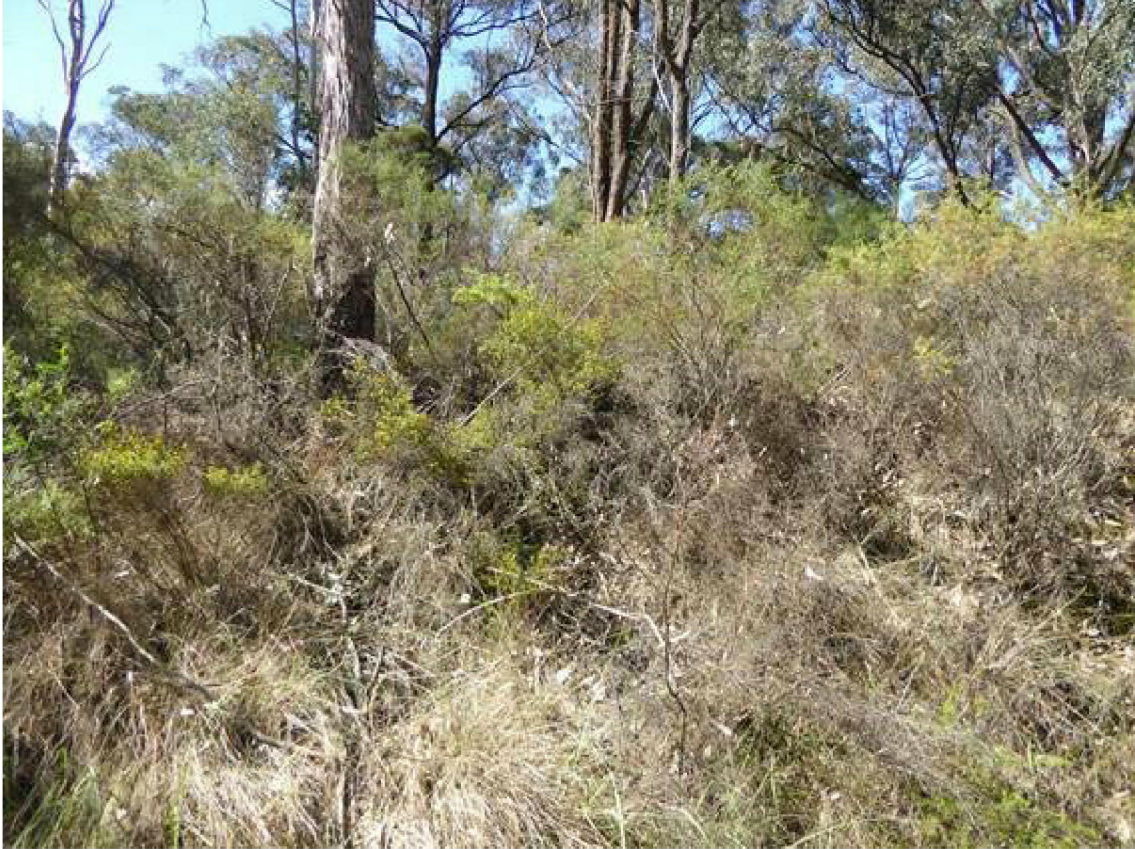
Photograph 2 Shale Gravel Transition Forest with Pultenaea parviflora present in the subject site

leaved Ironbark) and a sub-canopy of Melaleuca decora (Feather Honey-myrtle), as shown in Photograph 2 .