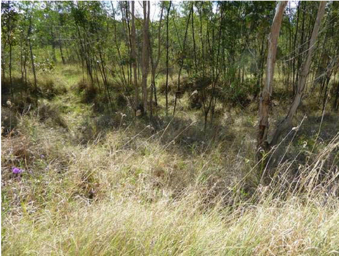
Photograph 4 Low Diversity Derived Native Grassland and Exotic Pasture in the road corridor