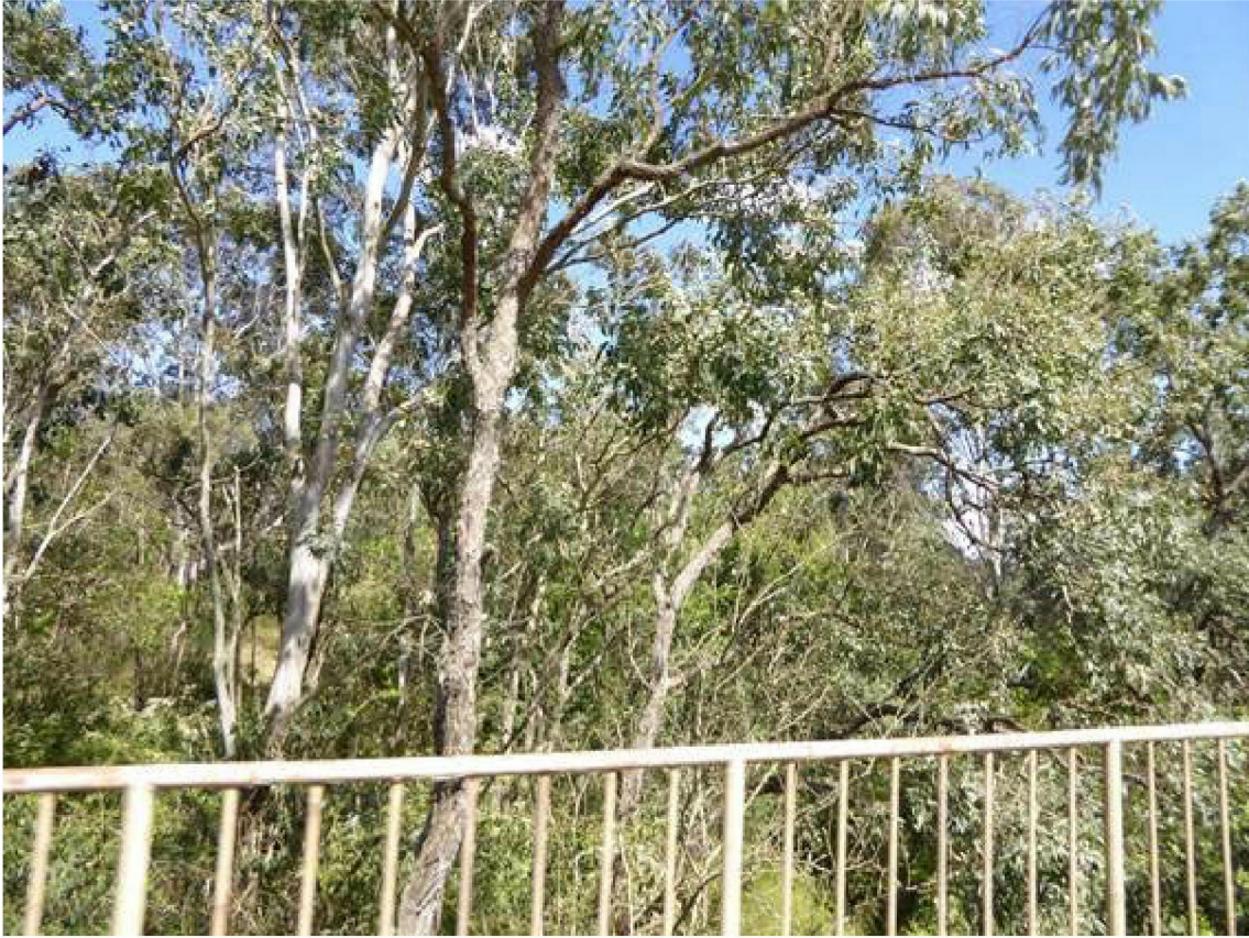
Photograph 3 River-flat Eucalypt Forest in South Creek riparian area

Low Diversity Derived Native Grassland and Exotic Pasture are present throughout much of the subject site, between patches of woodland and shrubland, and on the road verges, as shown in Photograph 4 .