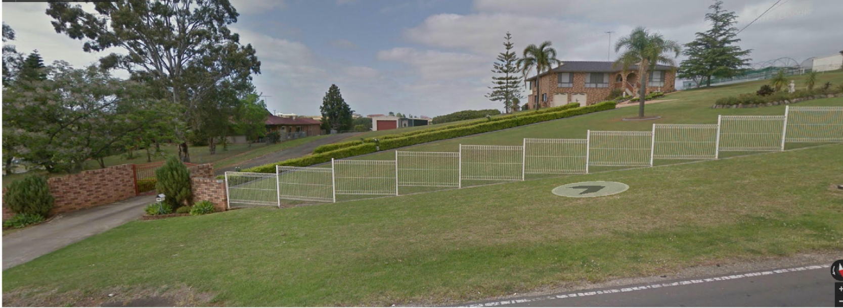
Street view of property showing driveway access from street