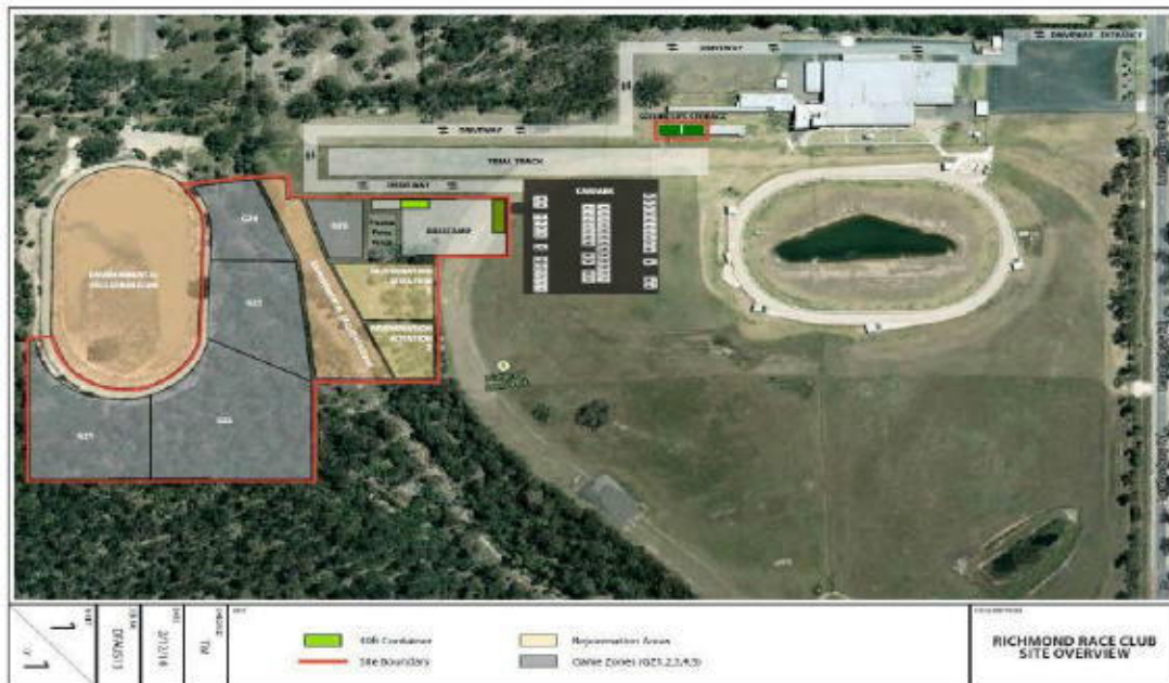
Figure 2 . Top the new proposal footprint, bottom the original proposal footprint.