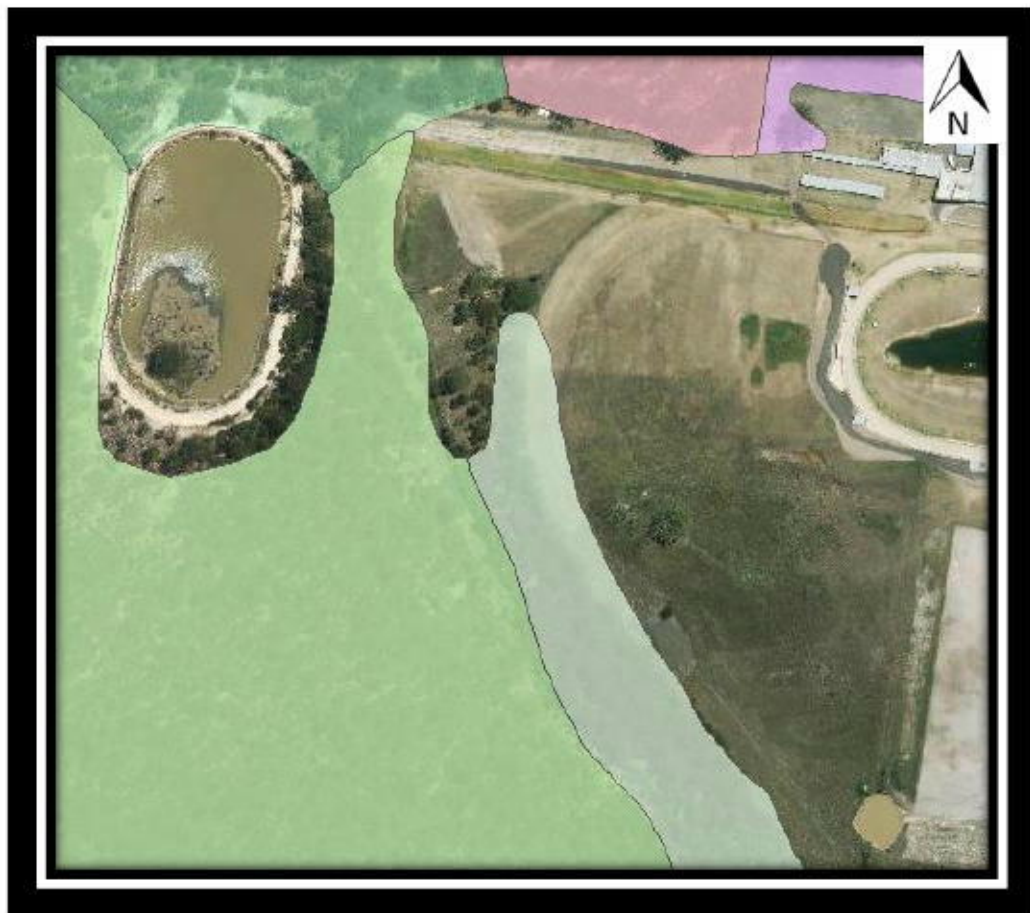
Figure 1. Vegetation Communities mapped for the site (six maps vegetation viewer)