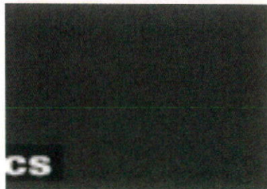
Window and Driveway Colour