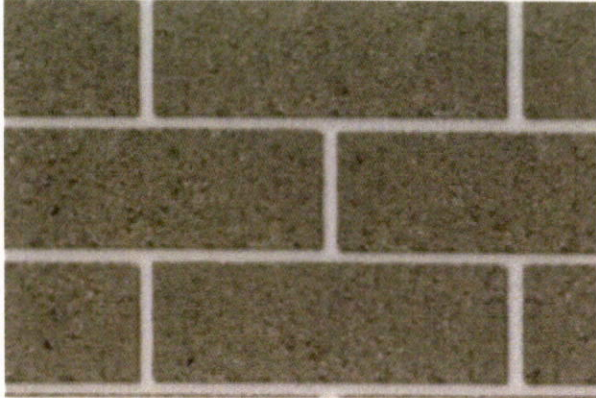
Brick used (Freedom)