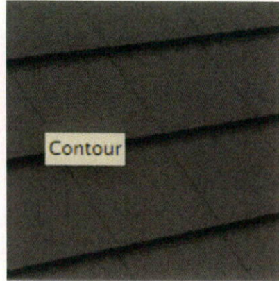
Roof Tile – Ebony