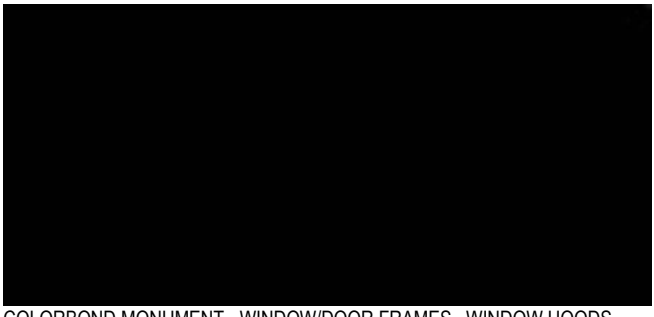
COLORBOND MONUMENT - WINDOW/DOOR FRAMES, WINDOW HOODS, ALUMINIUM LOUVRES & AWNING

Penrith City Council Materials & Finishes Schedule designed + drawn: M.Trinh & P.Revollar DA - Issue A paper/scale: NTS