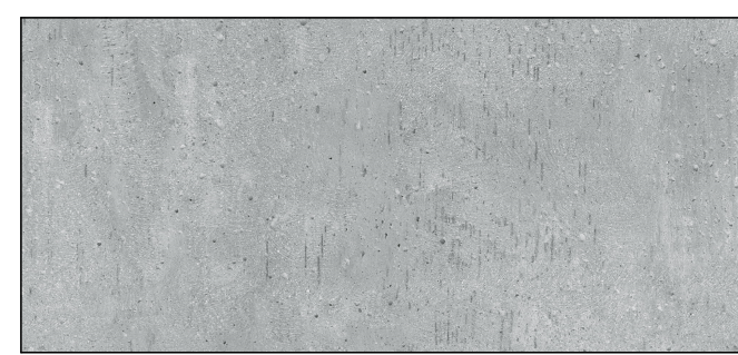
CEMINTEL CLADDING TO EXT. WALL & COLUMNS

Document Set ID: 9596789 Version: 1, Version Date: 21/05/2021