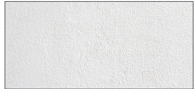
WHITE RENDER TO BLADE WALLS