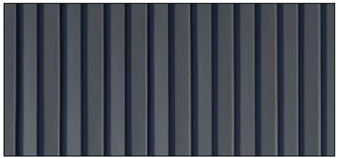
METAL CLADDING TO EXT. WALL. - BASALT - LYSAGHT LONGLINE 305