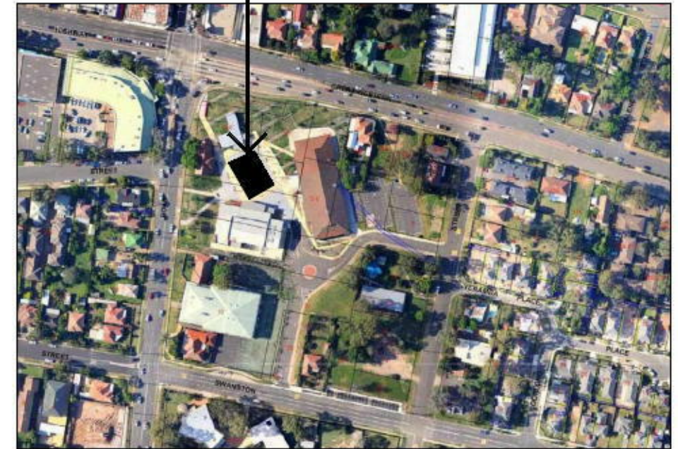
1 PLAN - LOCALITY NTS