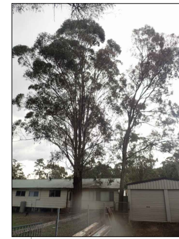
PLATE 2 - T3 AND T4 - TO BE REMOVED AS PER 10-50 RULE