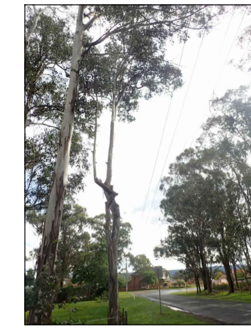
PLATE 4 - T21 (LEFT) - CANOPY REDUCTION TO MAINTAIN CANOPY CLEARANCE TO VEGETATION ON OPPOSITE SIDE OF ROAD. T21 (RIGHT) - REMOVAL REQUIRED