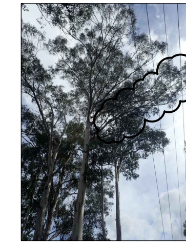
PLATE 5 - T21 - CANOPY REDUCTION REQUIRED.