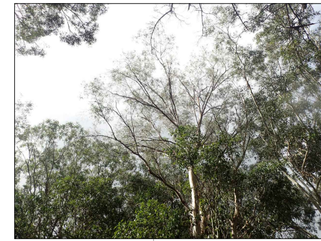
PLATE 3 - T17 - DEADWOOD AND THINNING / DISCOLOURED CROWN - PROPOSED TO BE REMOVED TO MAINTAIN CANOPY CLEARANCE AS PER APZ REQUIREMENT.