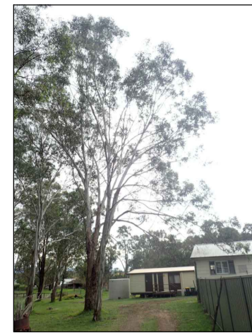
PLATE 1 - T1 AND T2 - TO BE REMOVED AS PER TO 10-50 RULE