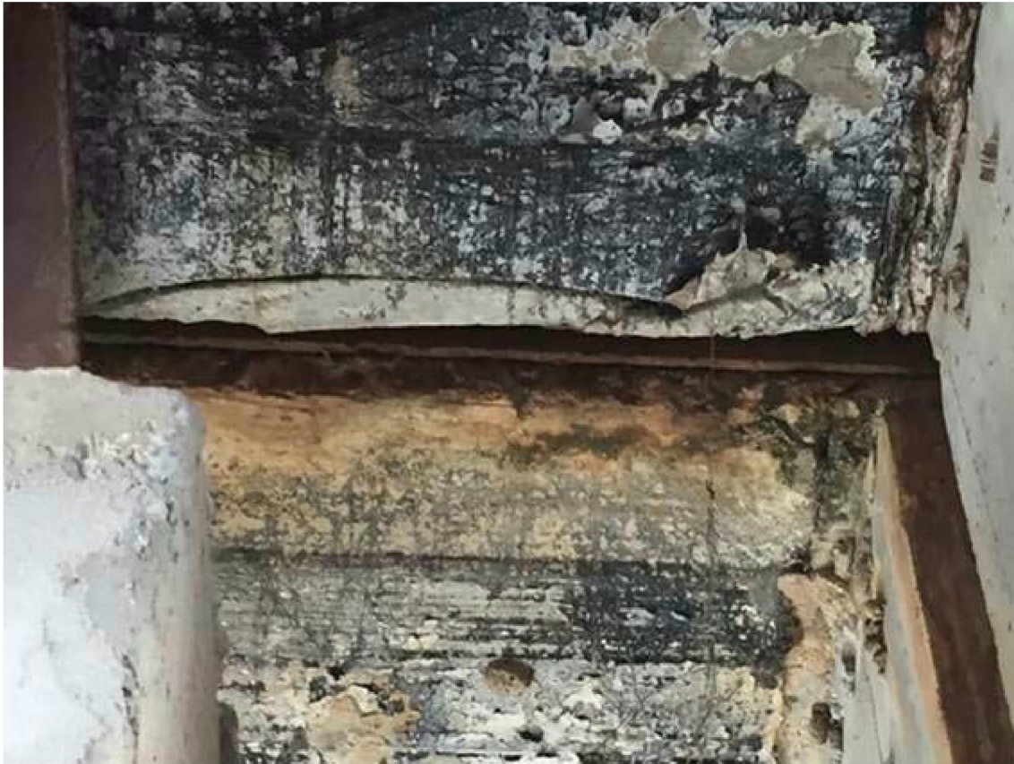
Photograph 4 Crevices between concrete formwork in Ropes Creek Bridge