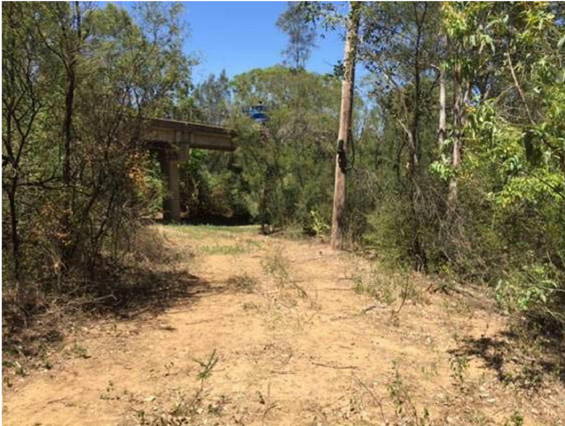
Photograph 2 Grassed access track within the Regional Park to be used for access during construction