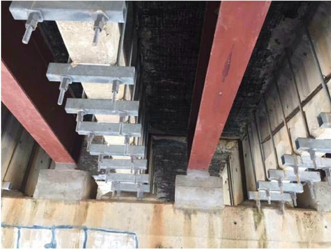
Photograph 3 View of the underside of Ropes Creek Bridge