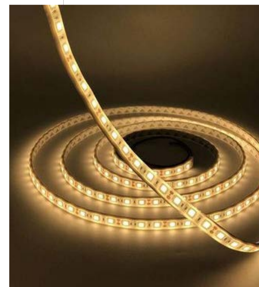
Strip lighting to north boundary seating areas