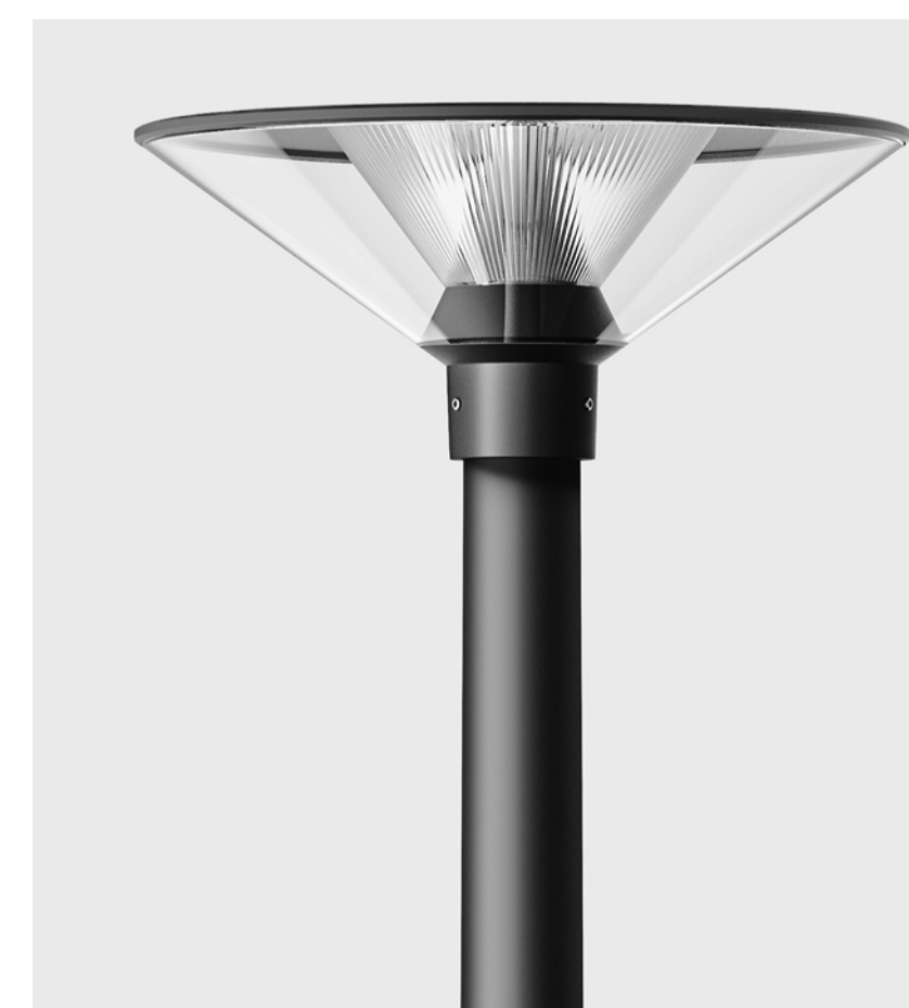
Post top carpark lighting