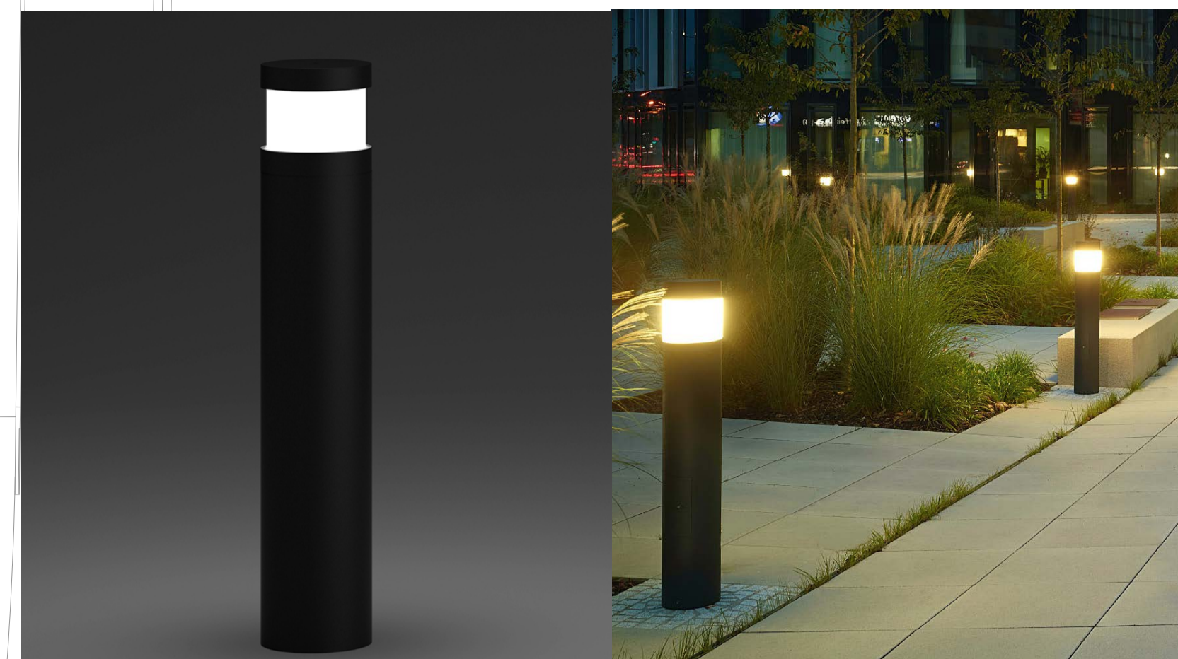
Bollard lighting for beer garden