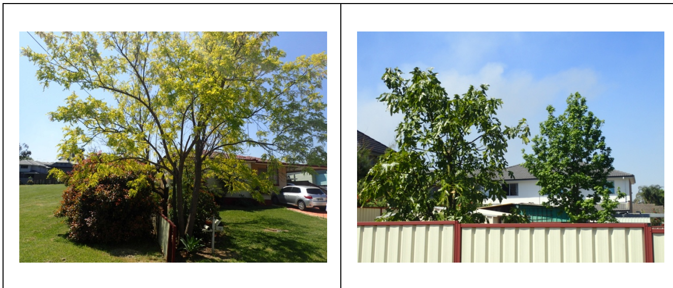
Plate 1 – Front Setback