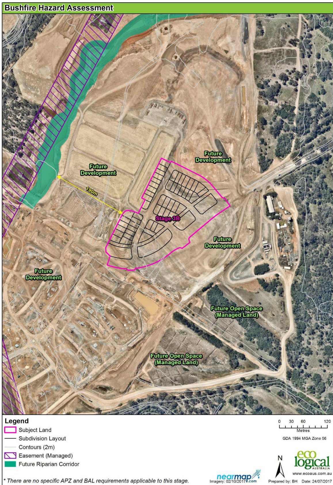
Figure 4: Stage 3b bushfire hazard analysis and separation distances