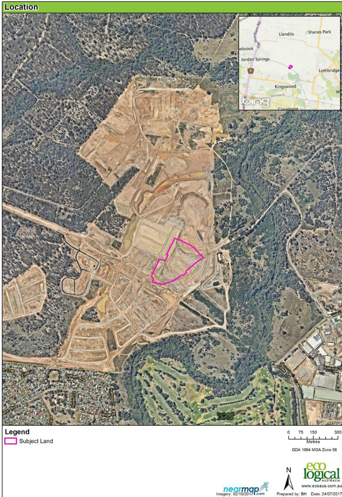
Figure 1: Location of Stage 3b