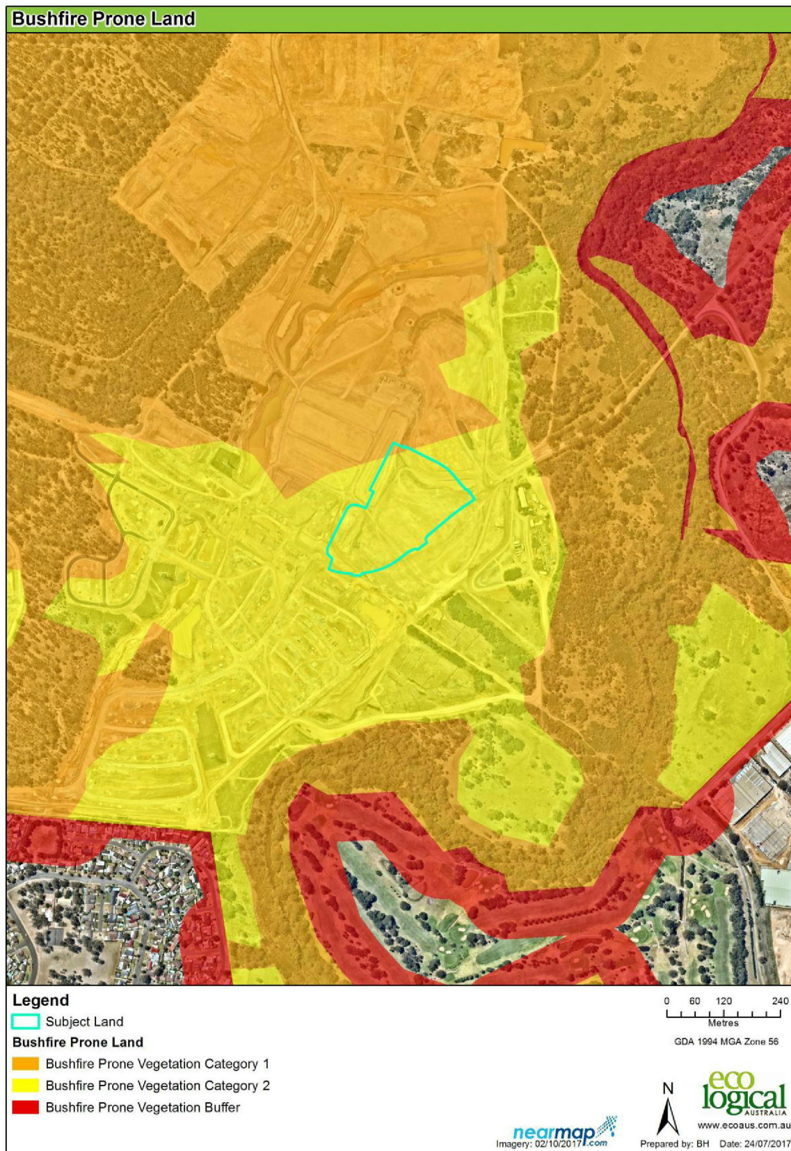
Figure 3: Stage 3b subdivision – Bush Fire Prone Land Map (Penrith City Council)