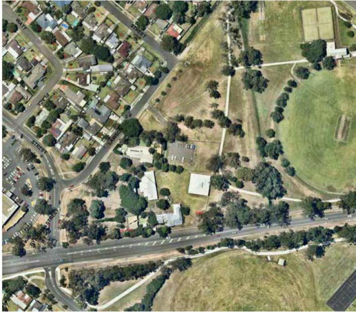
Figure 1: Aerial Subject site- highlighted Date: 20 March 2017