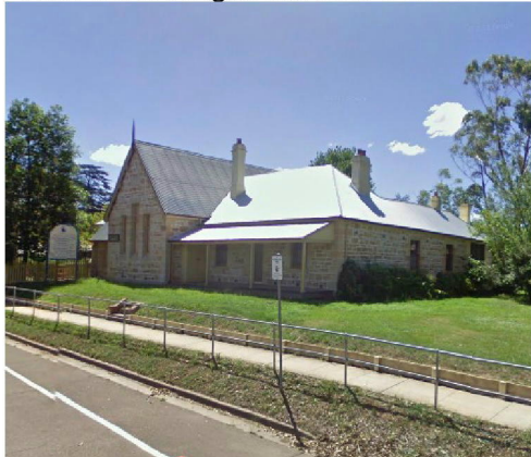
Former Emu Plains Public School