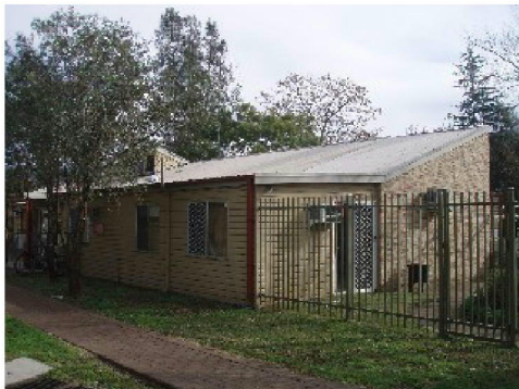
Emu Plains Kid Place