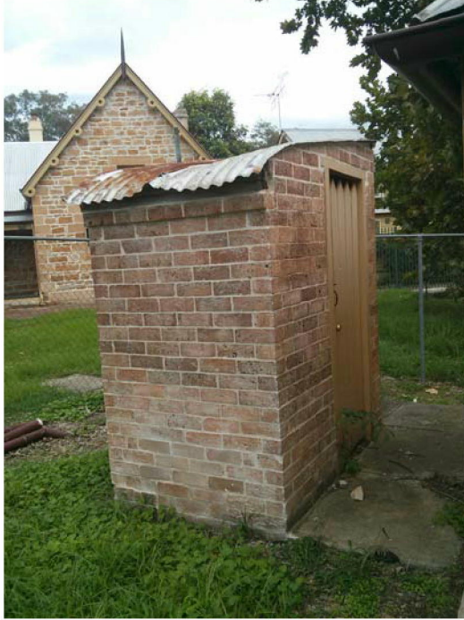
Former Emu Plains Public School toilet