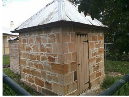
Former Emu Plains Public School Kitchen