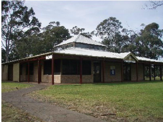
Emu Village OOSH (Former Emu Plains Library)