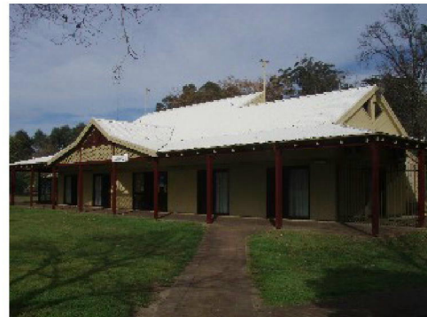
Emu Plains Neighbourhood Centre