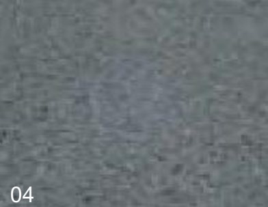
04 TIMBER CLAD TIMBER FINISH