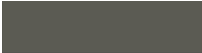
Dulux Woodland Grey