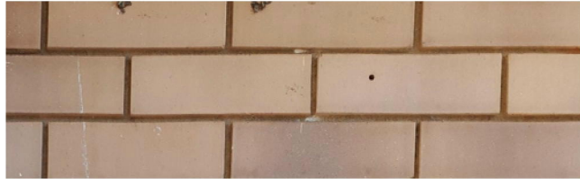
Face brickwork – smooth face blonde brick